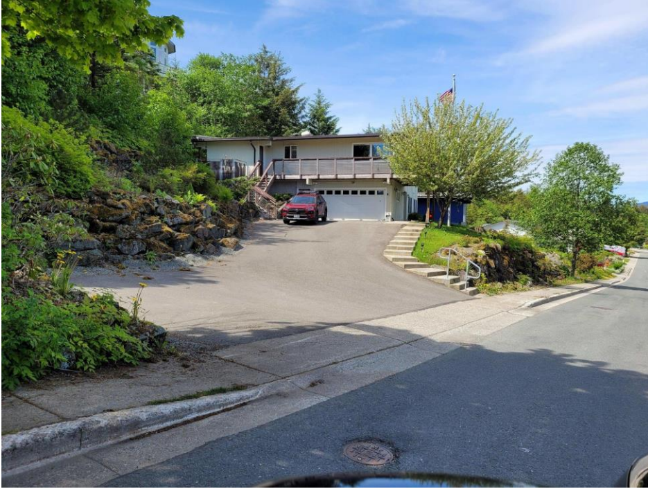
The driveway with attached garage