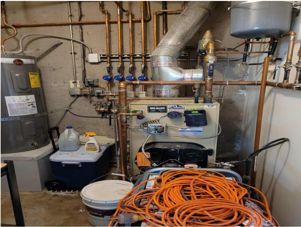
Furnace and water heater