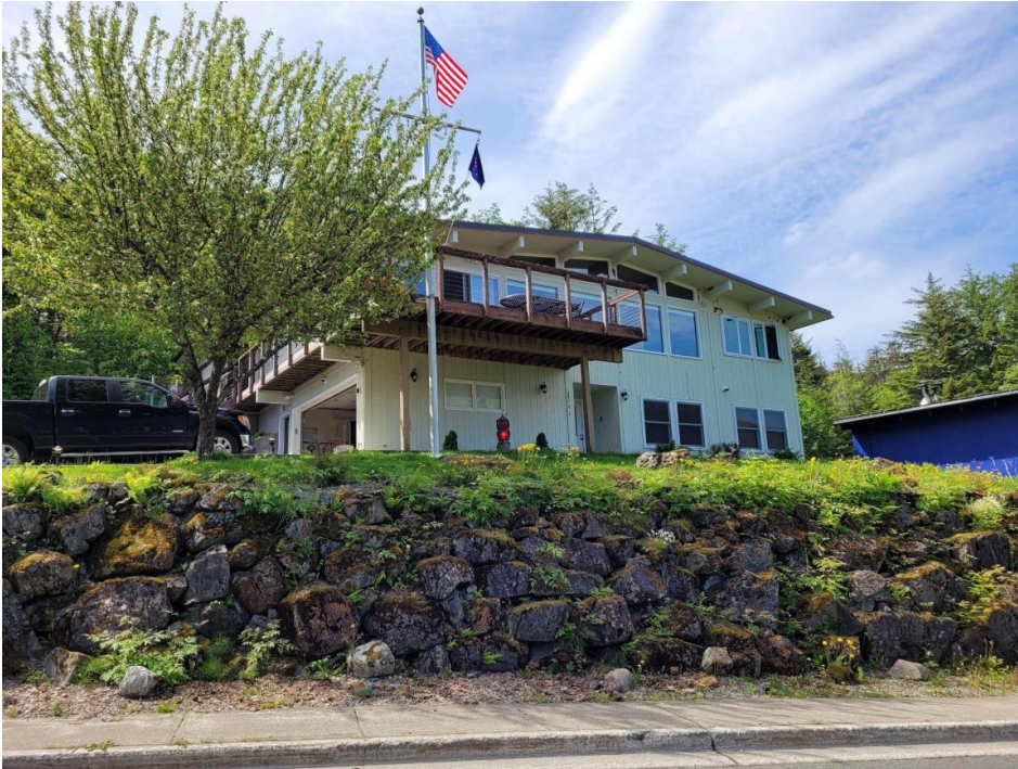
Exterior front view of Property