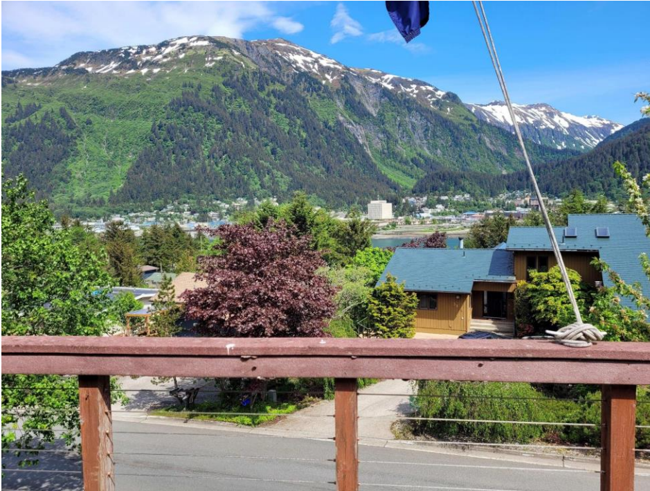
The view from the front deck