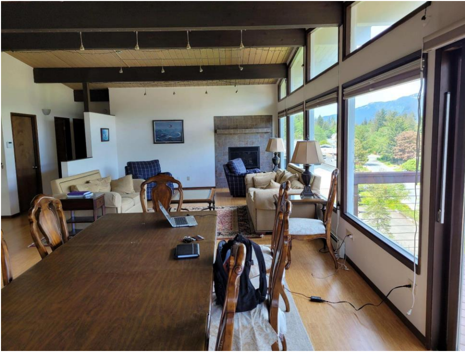
Living room and dining room