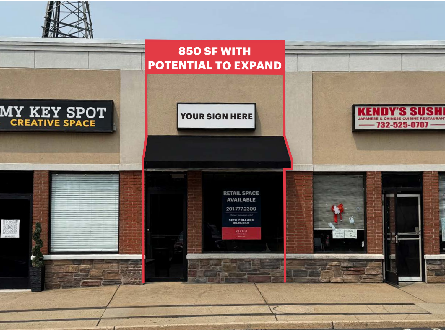
UNIT 11 - 850 SF