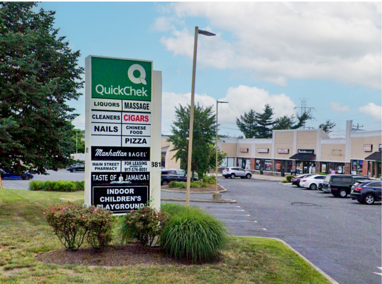
PYLON - 2 SIDED

QuickChek, Manhattan Bagel, Delco Air, Addy's Barbeque, Kendy's Sushi & Peking Garden, Main Street Specialty Pharmacy, Main Street Liquors, MiMa Create & Play