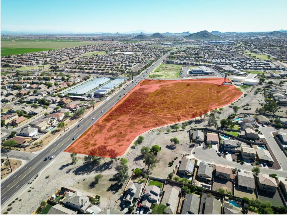
Facing SE View small