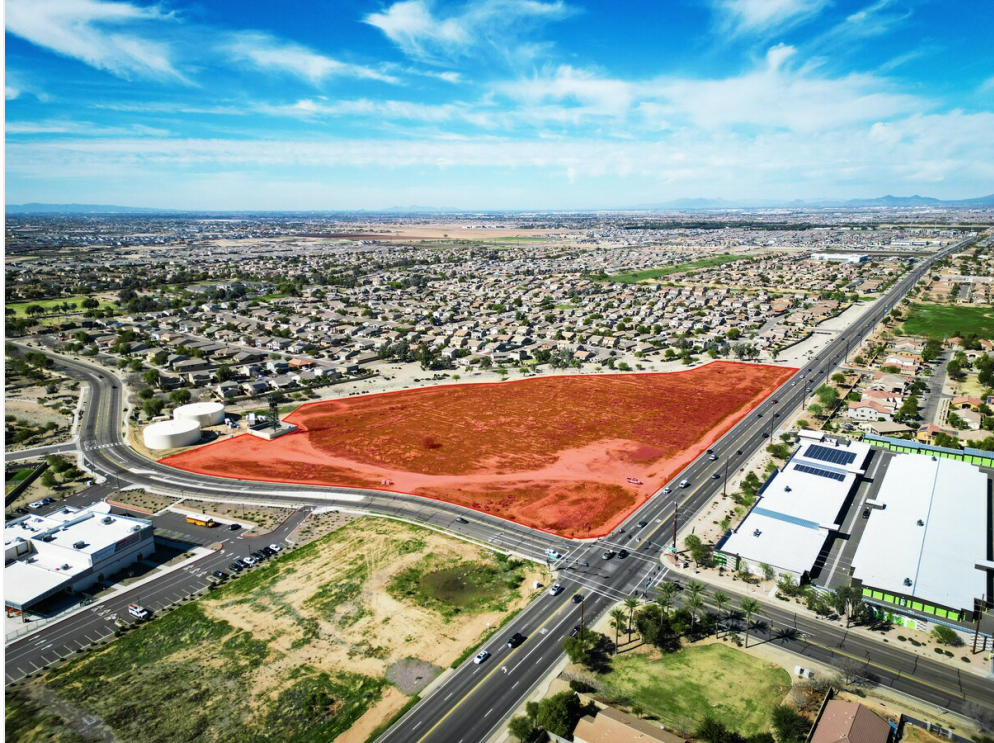
Facing NW View small