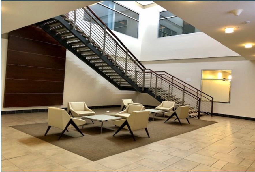
Class A Lobby