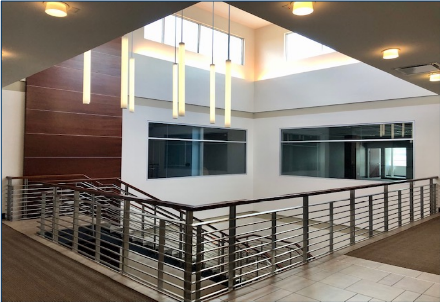
Community Conference Room