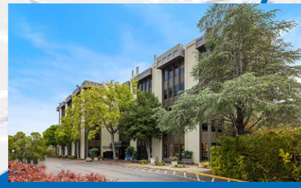
1050 Northgate Drive | San Rafael