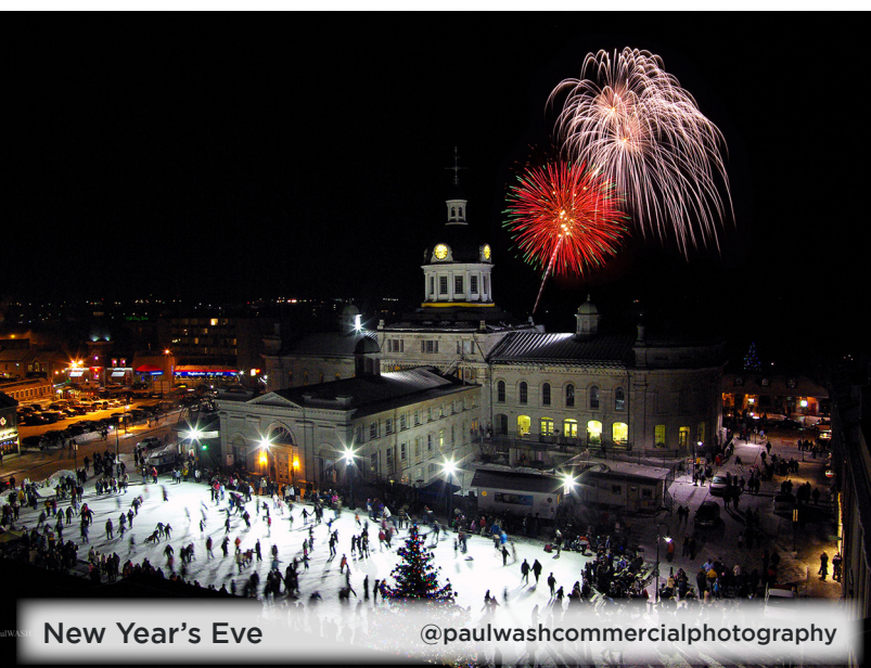
New Year's Eve