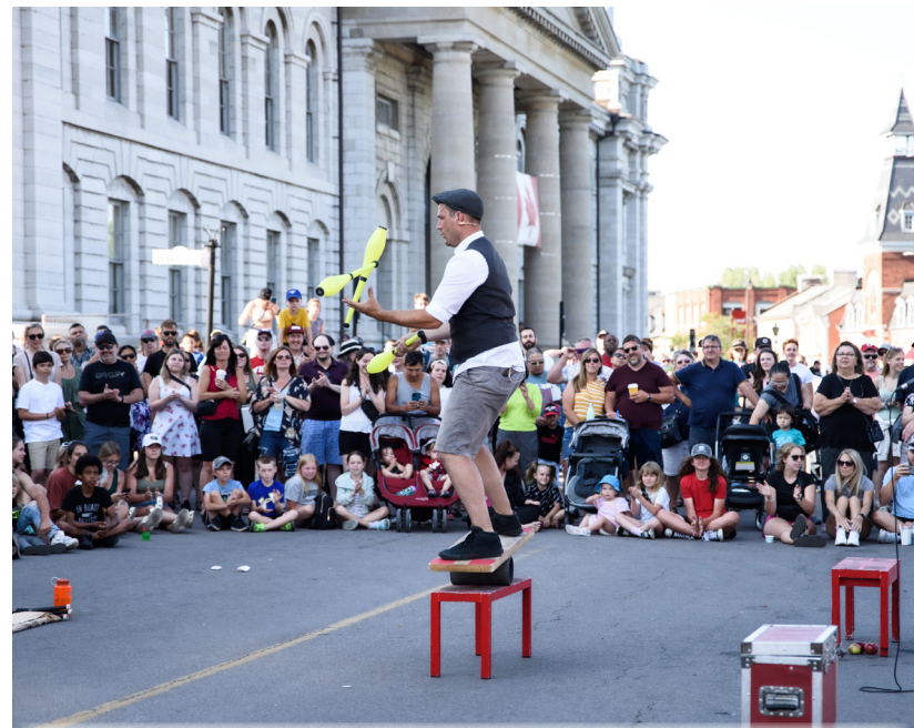
Kingston Buskers Festival