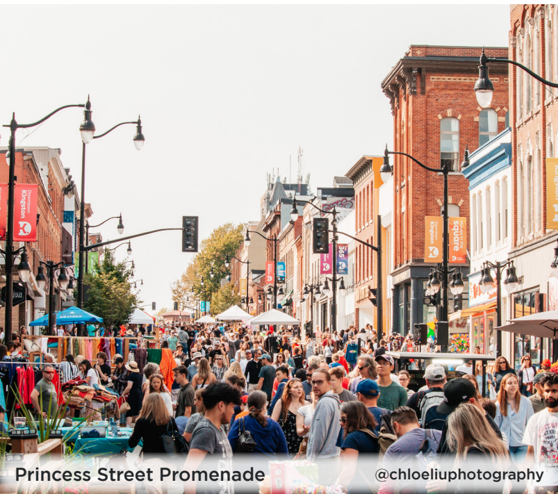
Princess Street Promenade

The Kingston Downtown Business Improvement Area (BIA), in collaboration with Tourism Kingston and the Kingston Economic Development Corporation, supports the success of more than 700 commercial properties, business owners, and tenants within the City of Kingston's downtown core. Through coordinated efforts focused on street beautification and maintenance, financial funding support, access to local and governmental resources, special events, and strategic marketing initiatives, these organizations foster a vibrant and resilient downtown environment. Together, they advance business investment, strengthen Kingston's tourism sector, and promote meaningful community engagement within the commercial core.