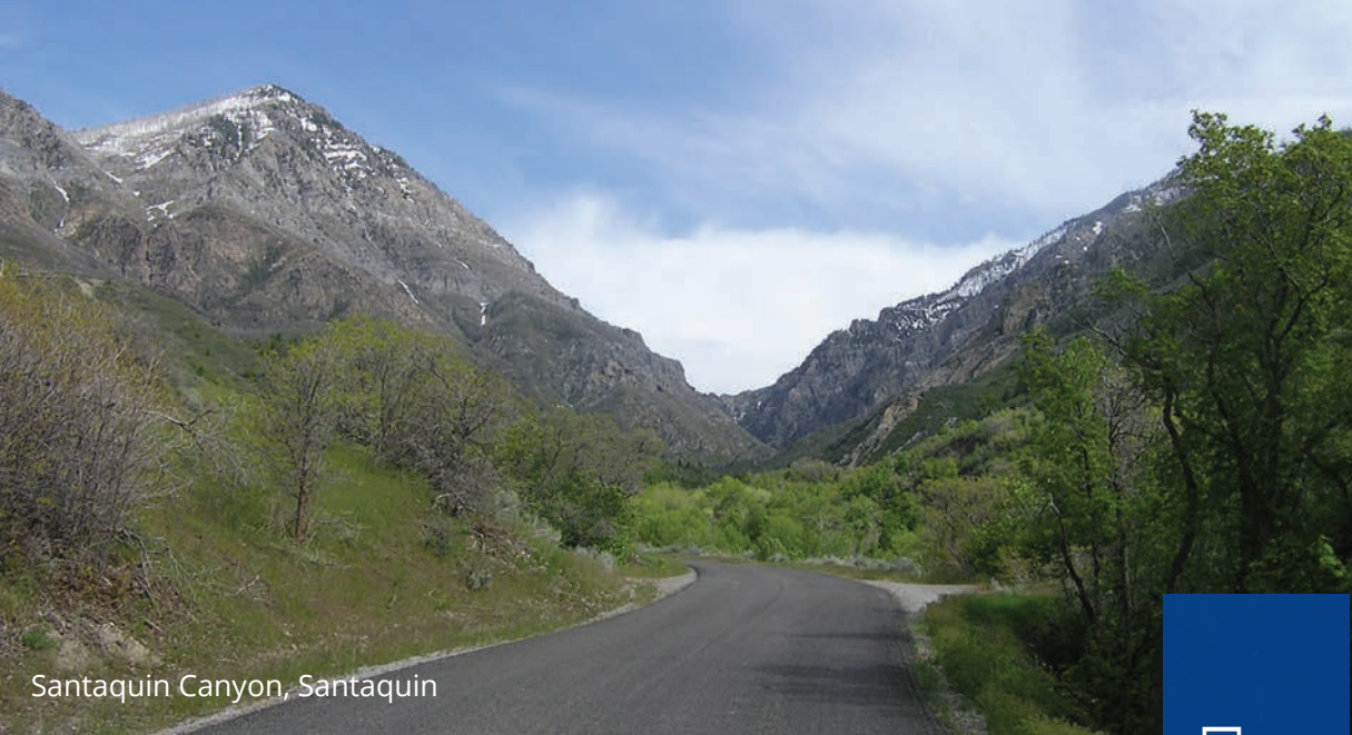
Santaquin Canyon, Santaquin