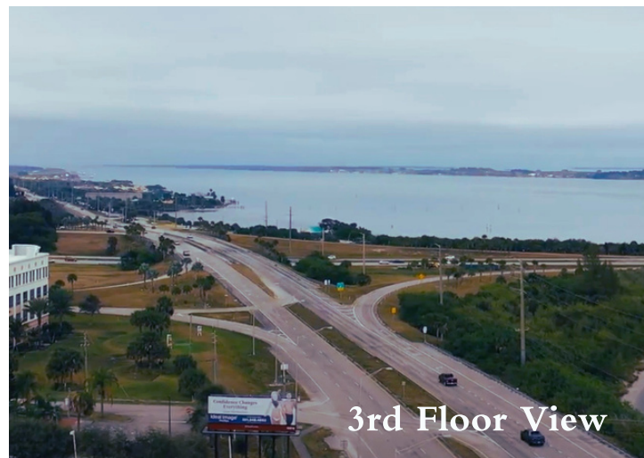
3rd Floor View