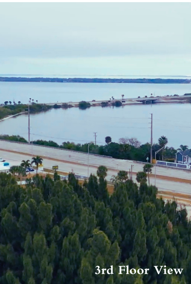
3rd Floor View