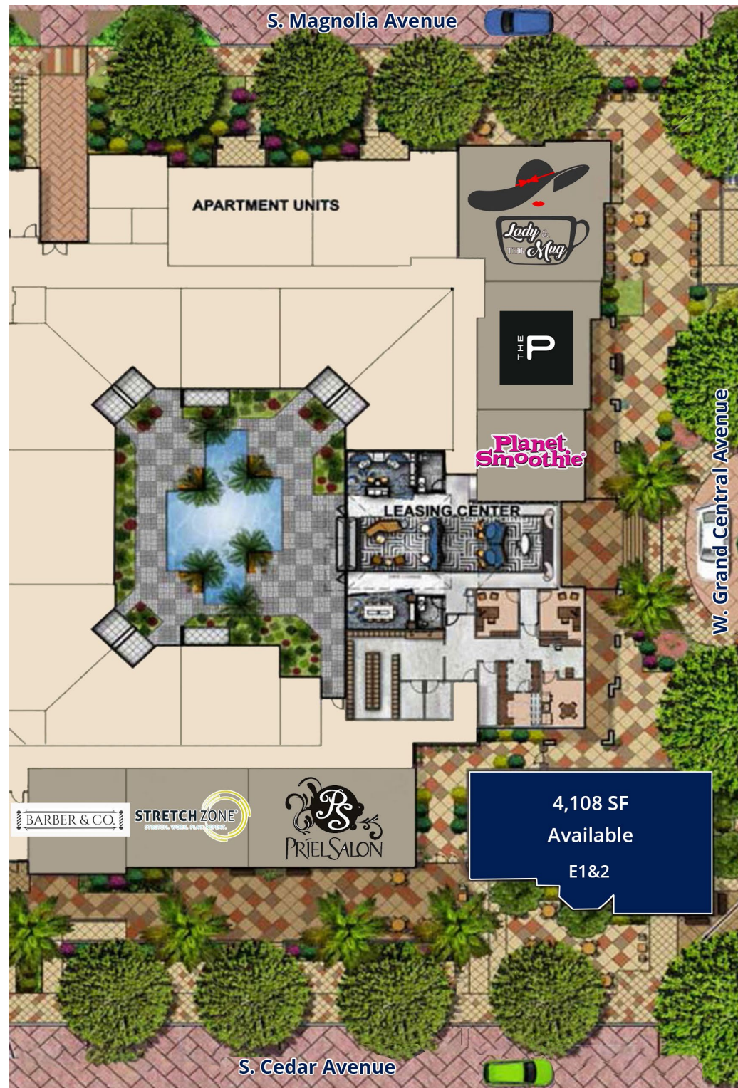
Retail Site Plan