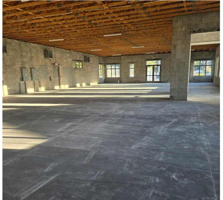
CONCRETE SLAB IN PLACE