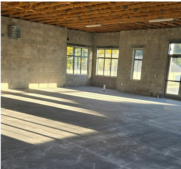
Add text here...