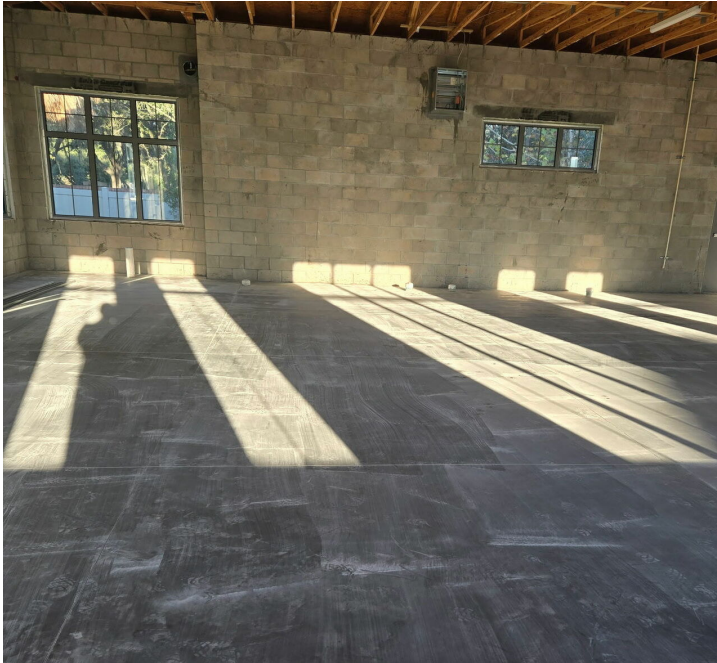
CONCRETE SLAB IN PLACE