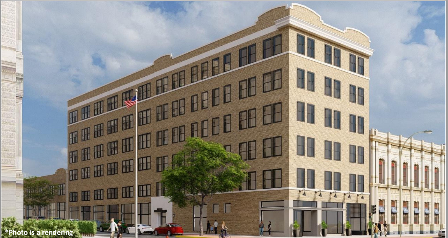
*Photo is a rendering

COMMERCIAL REAL ESTATE SALES | LEASING | CONSULTING | DEVELOPMENT | MANAGEMENT