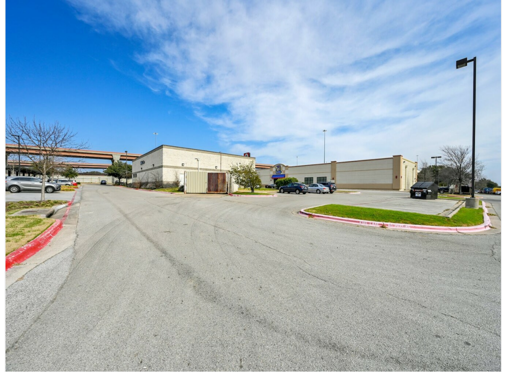
006-433001-451 West Louis Henna Boulevard 06_12088234