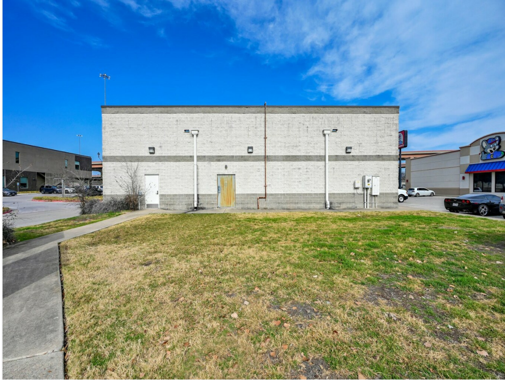
007-433001-451 West Louis Henna Boulevard 07_12088237