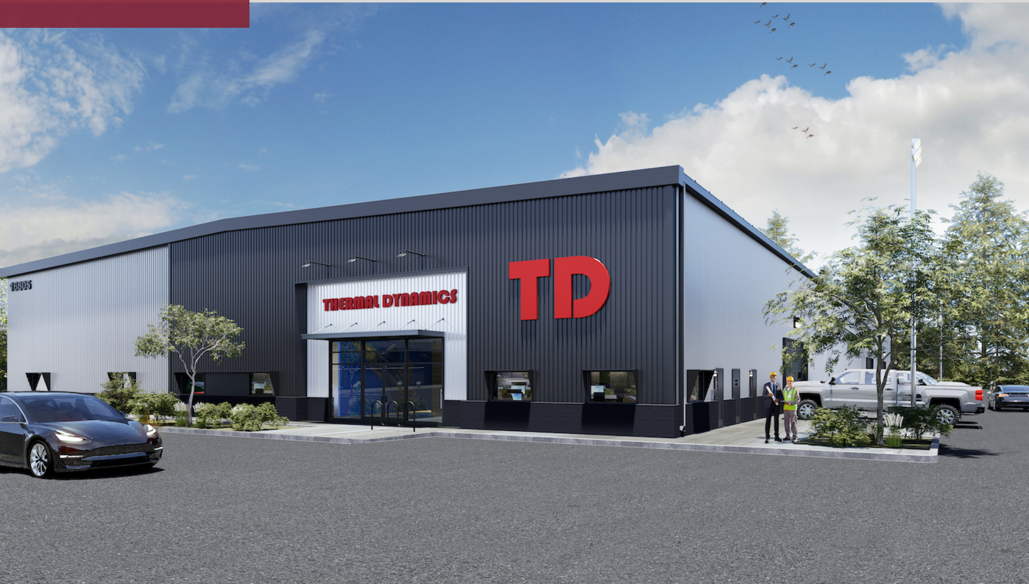
Sample Build-To-Suit Rendering

16805-16815 SE 120th Avenue, Clackamas, OR 97015