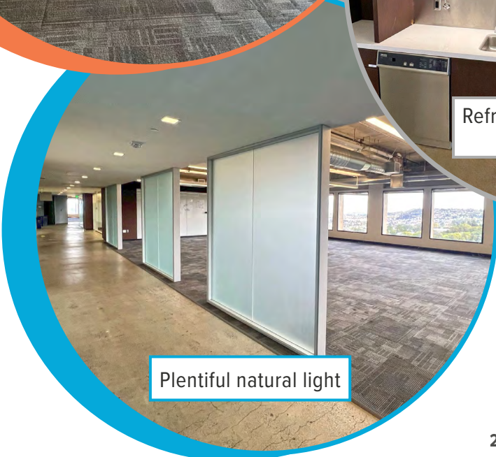
Refreshed Kitchen / Break Area