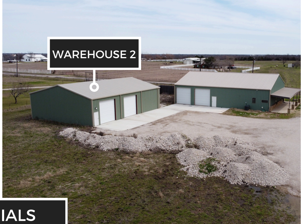
AERIALS WAREHOUSE 2