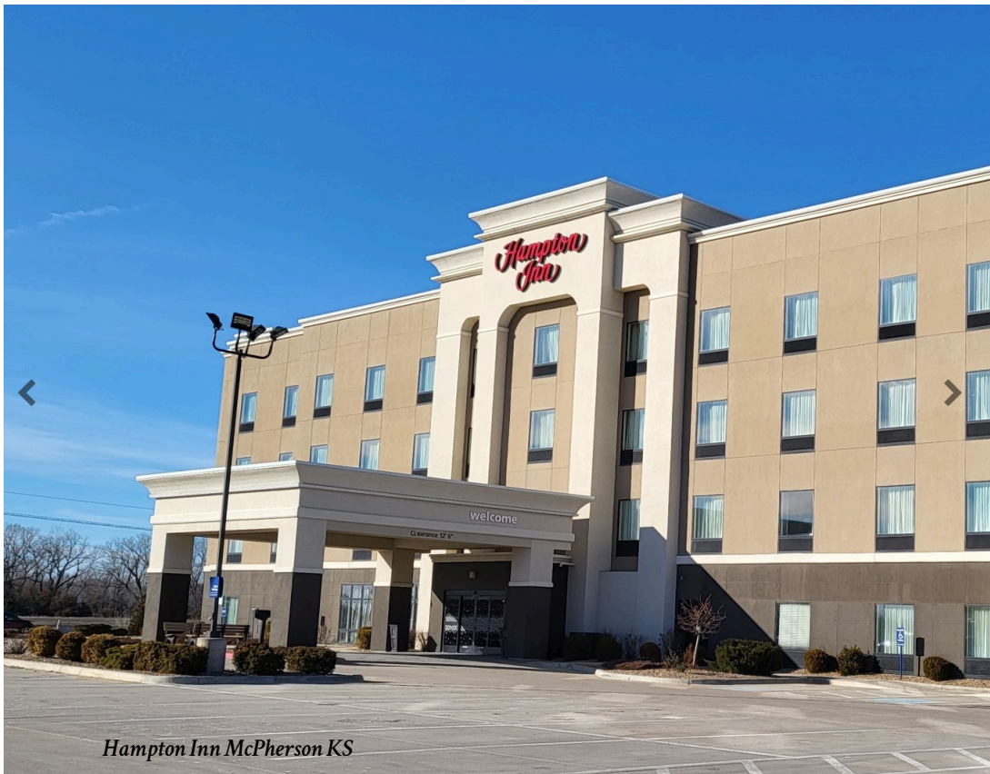
Hampton Inn McPherson KS