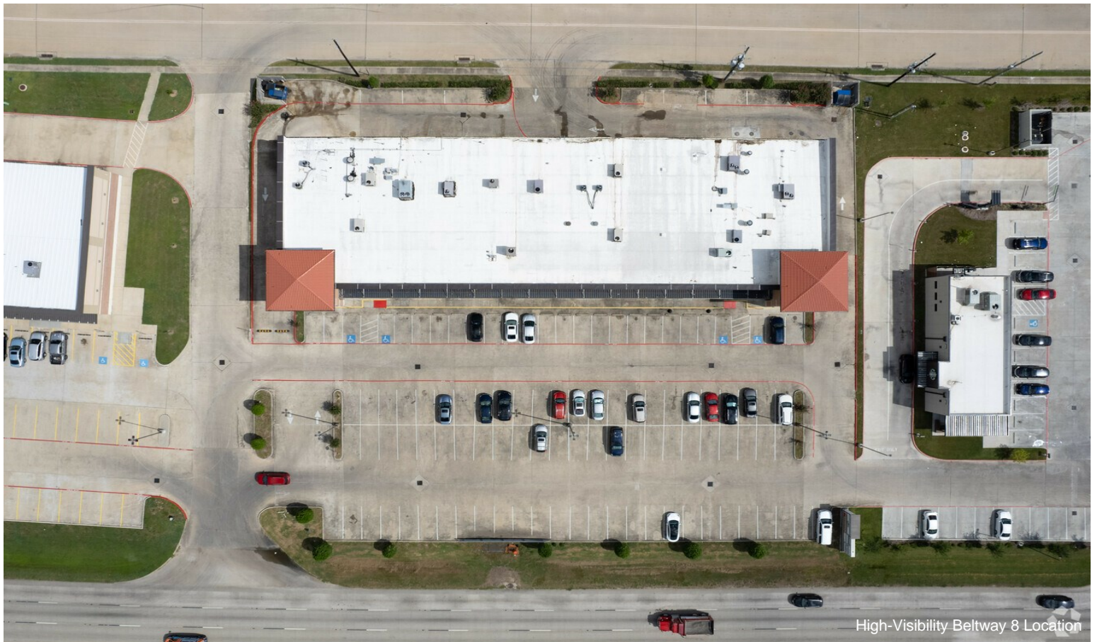
High-Visibility Beltway 8 Location