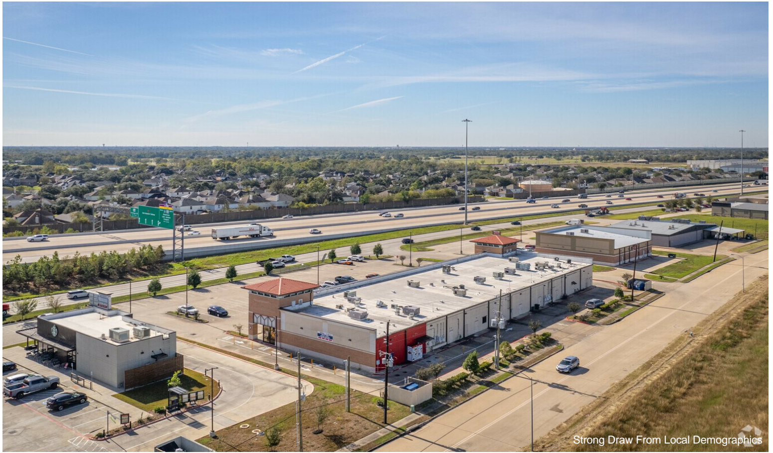
Strong Draw From Local Demographics