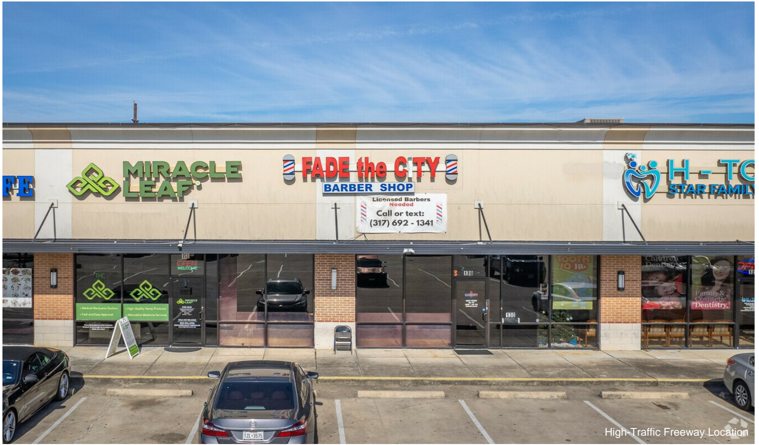
High-Traffic Freeway Location