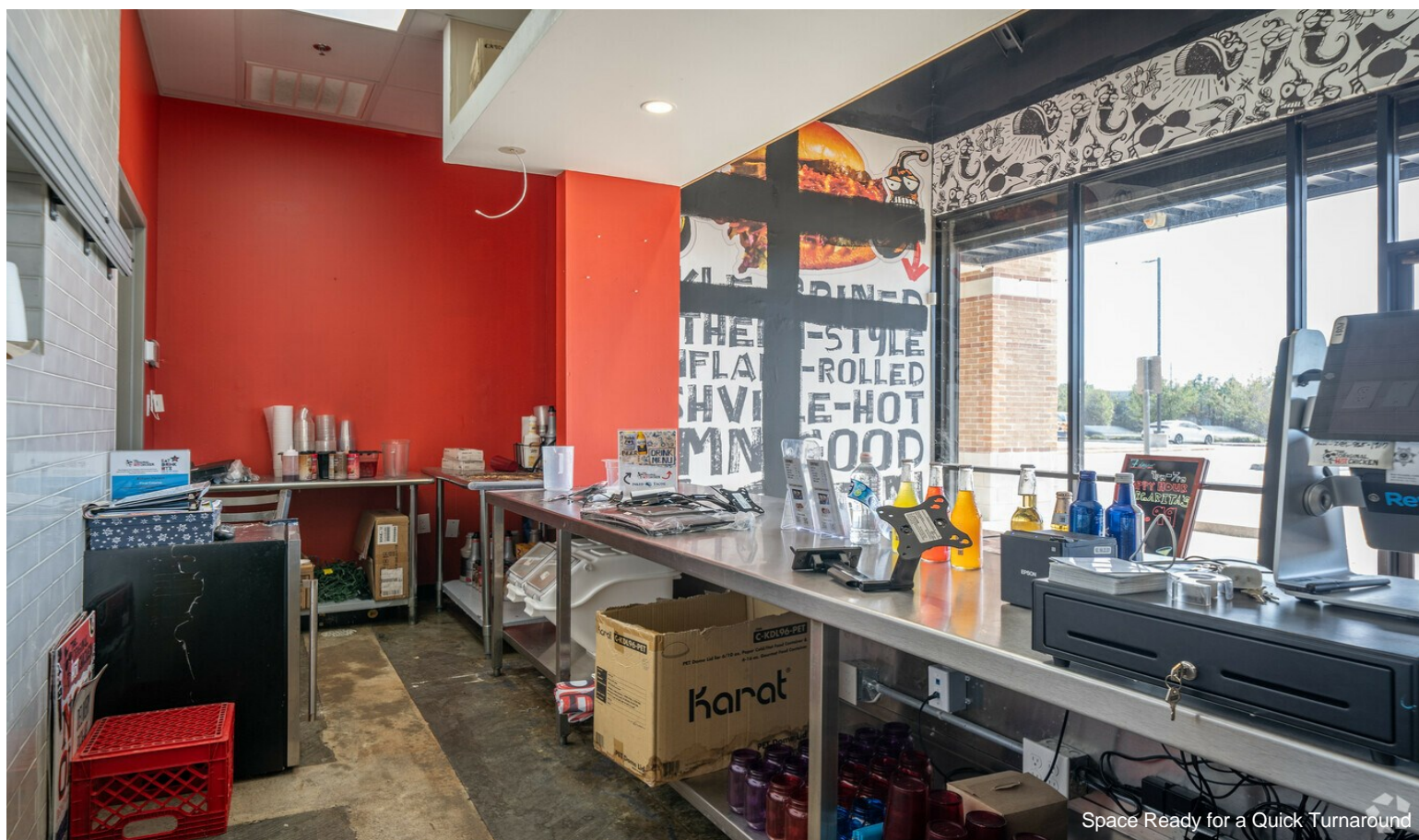
Space Ready for a Quick Turnaround