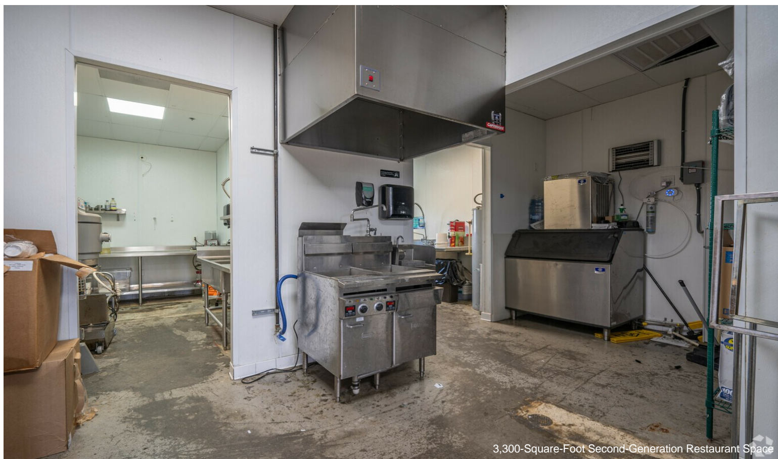
3,300-Square-Foot Second-Generation Restaurant Space