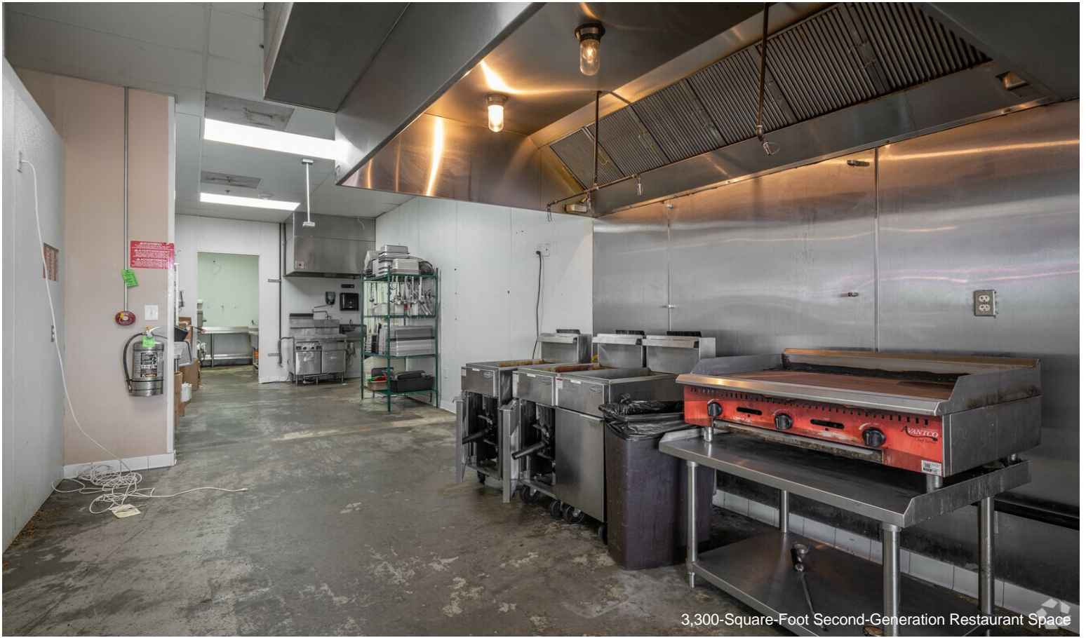
3,300-Square-Foot Second-Generation Restaurant Space