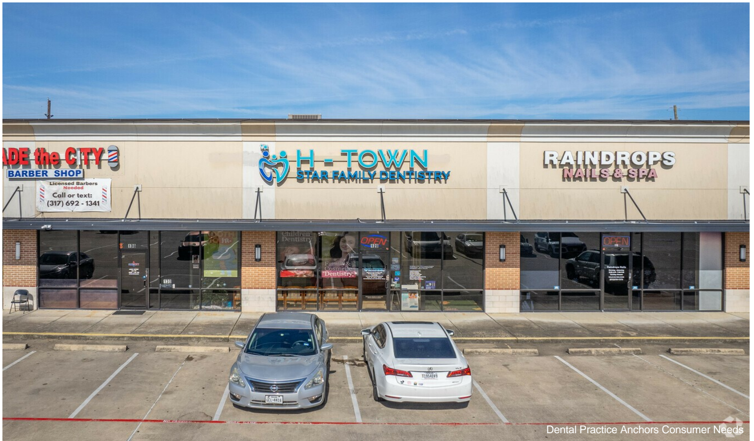
Dental Practice Anchors Consumer Needs