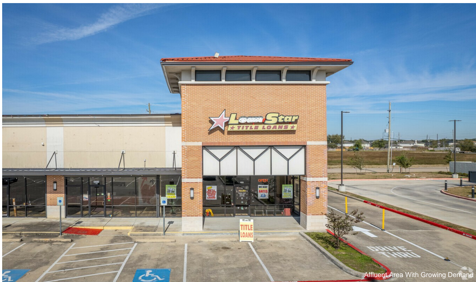
Affluent Area With Growing Demand