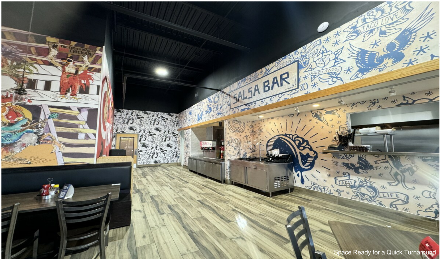
Space Ready for a Quick Turnaround