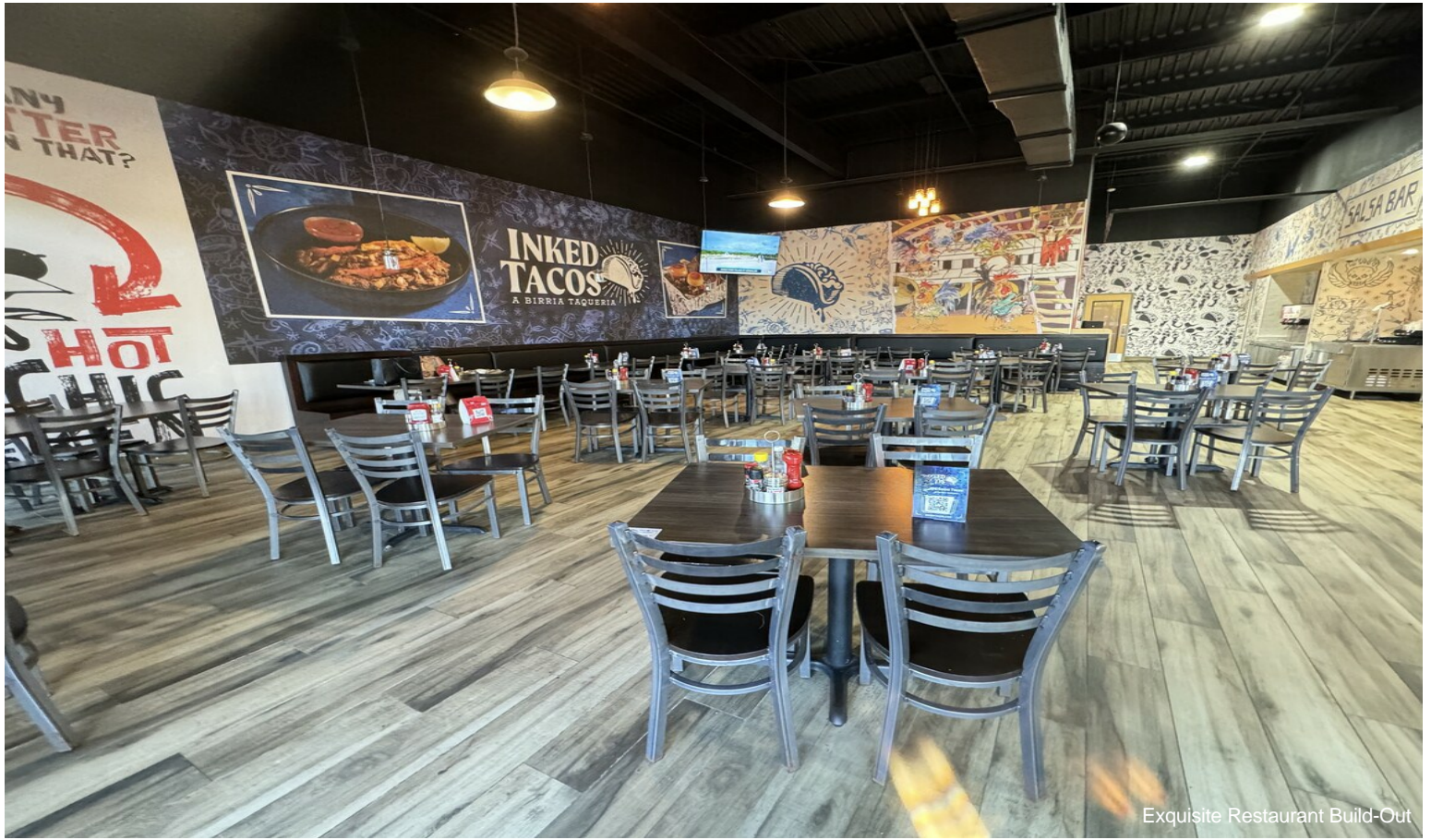
Exquisite Restaurant Build-Out