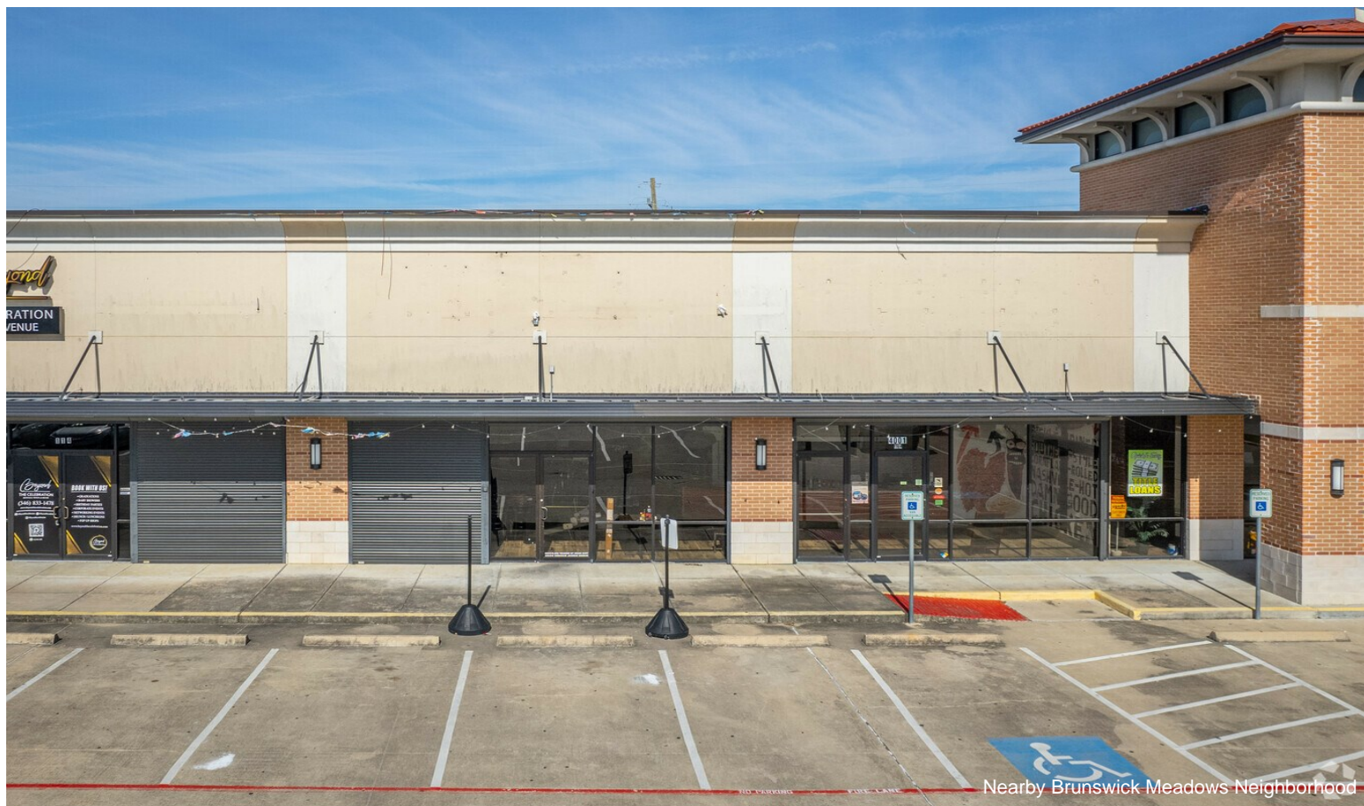
Nearby Brunswick Meadows Neighborhood