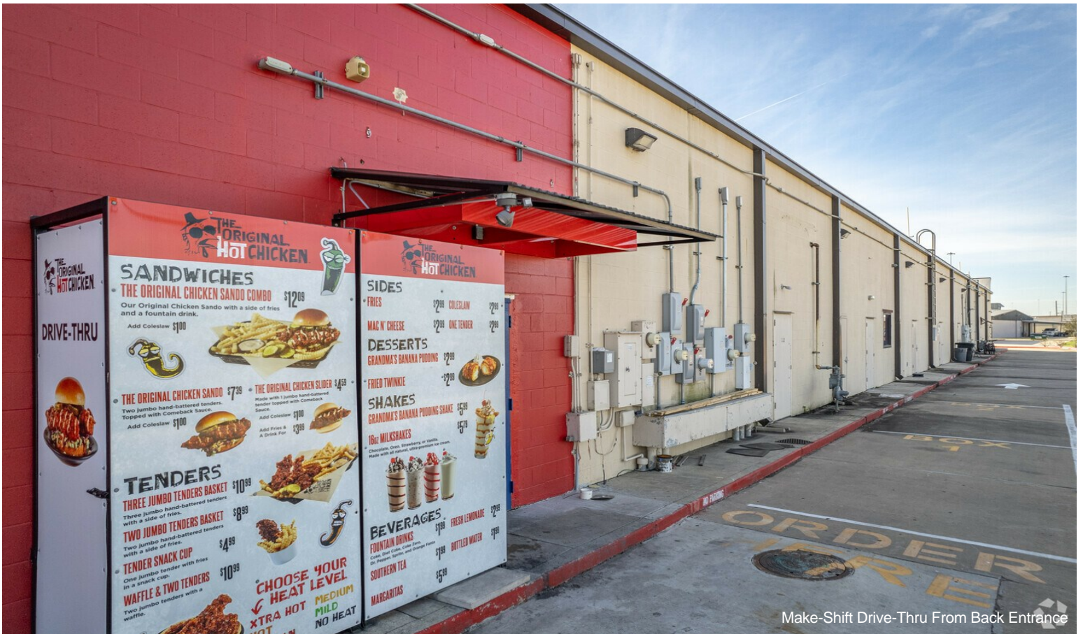
Make-Shift Drive-Thru From Back Entrance