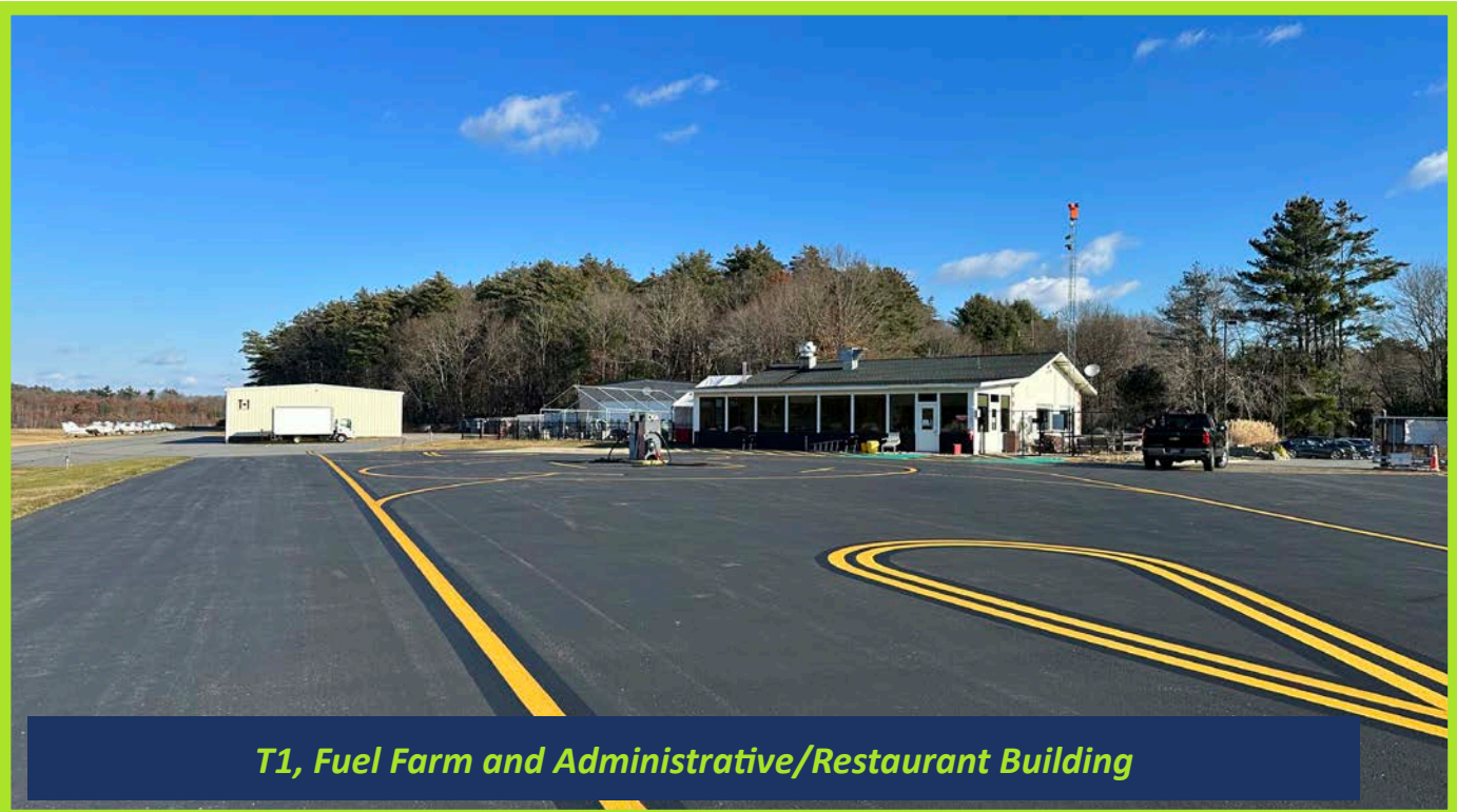
T1, Fuel Farm and Administrative/Restaurant Building

The airport enjoys a very positive relationship with the town and is seeking a new custodian who will continue to safeguard the airfield and provide quality management in pursuit of the airport's long-standing mission of 'Boosting the Economy, Supporting the Community and Nurturing the Environment'.