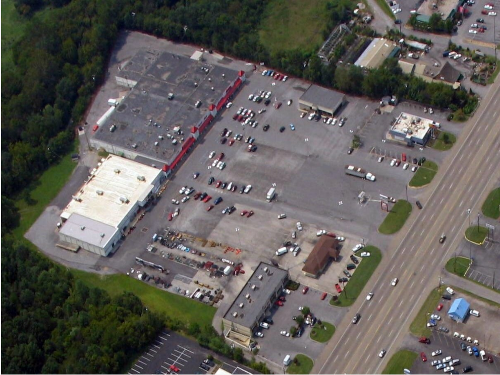
1409 E. Stone Drive- Ariel Photo (2)