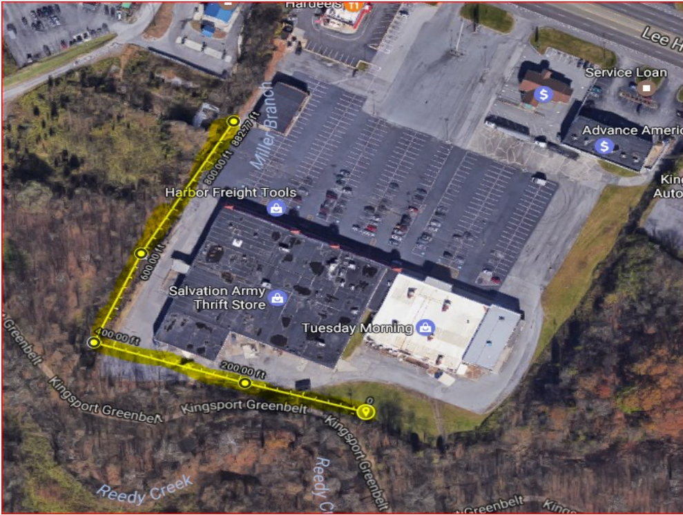
1409 E. Stone Drive- Ariel Photo (3)