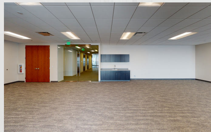
SUITE 710, 2,816 RSF Spec Suite