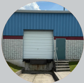
ONE DOCK-HIGH DOOR