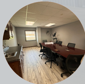
2,800 SF OFFICE