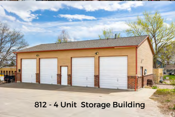
812 - 4 Unit Storage Building