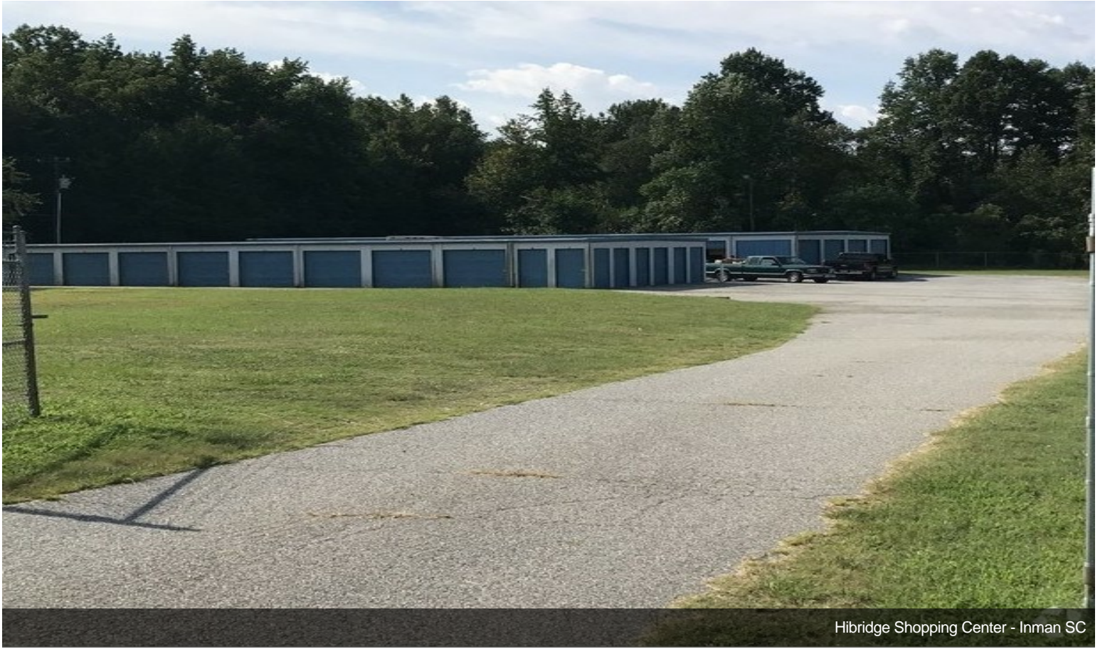
Hibridge Shopping Center - Inman SC