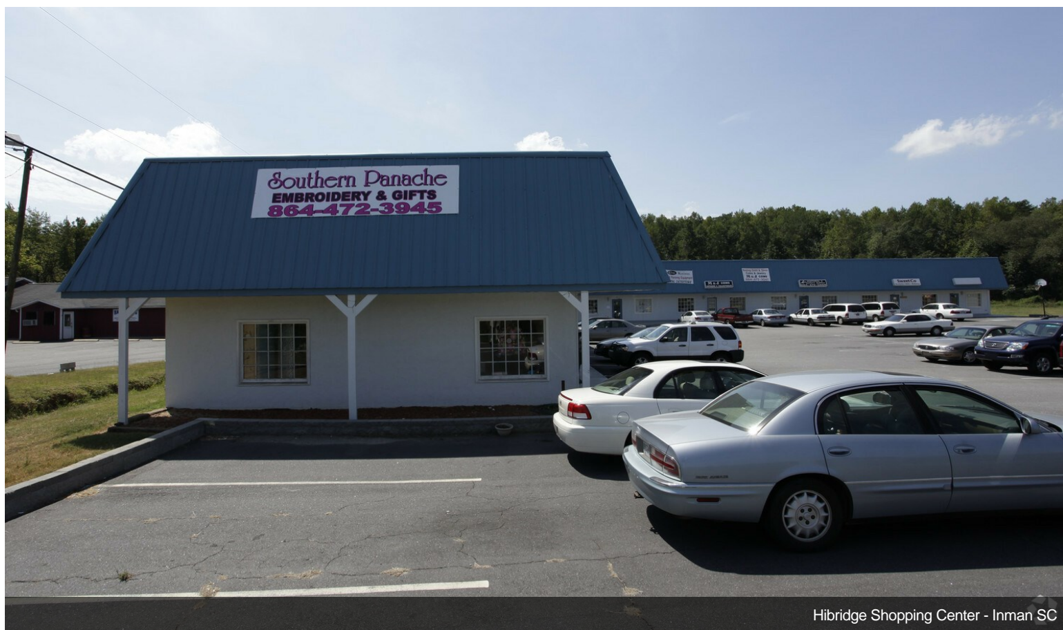
Hibridge Shopping Center - Inman SC