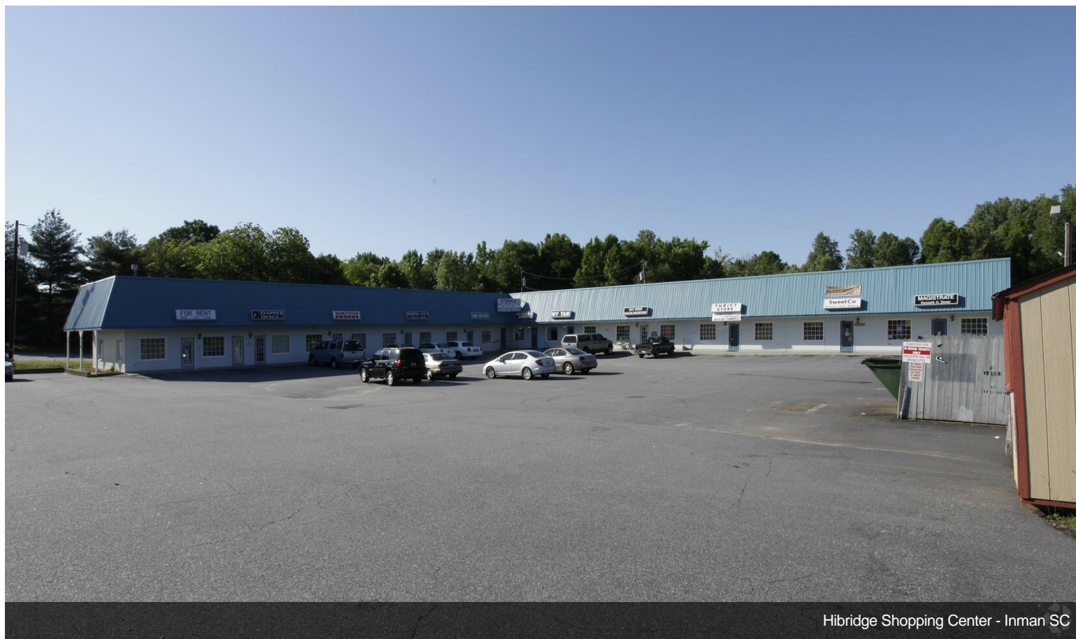
Hibridge Shopping Center - Inman SC