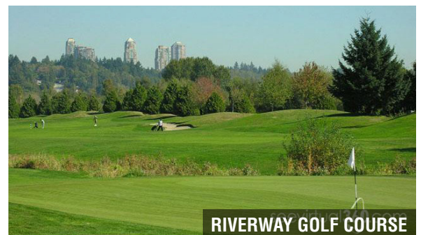
RIVERWAY GOLF COURSE