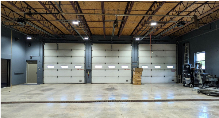
Open warehouse with access to three (3) OH doors, heated space with floor drains