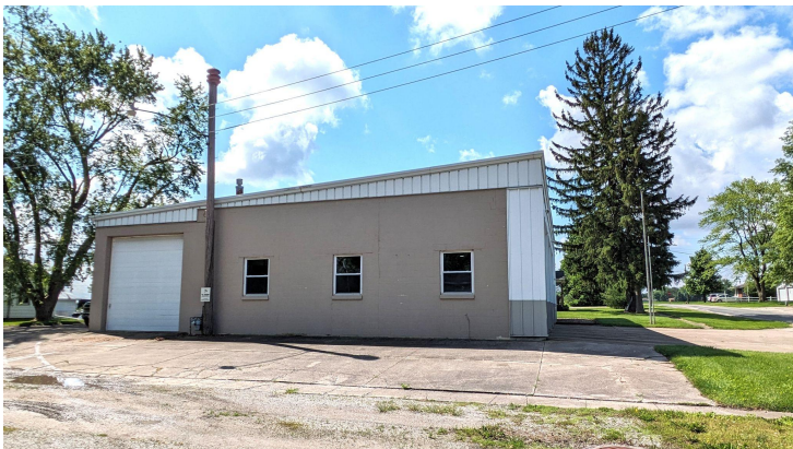
Fourth overhead door on the side of the building, large vehicle, material or equipment storage area