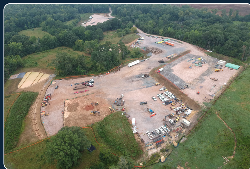
7 ACRES NORTH LOT