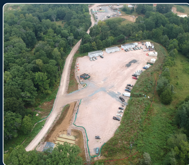
3 ACRES SOUTH LOT