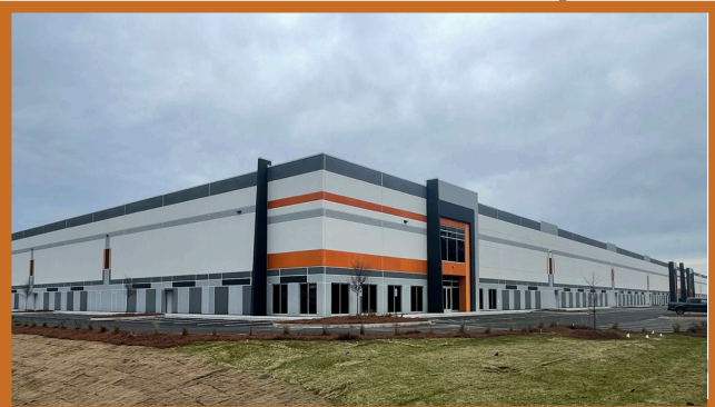
DORCHESTER COMMERCE CENTER Available Immediately