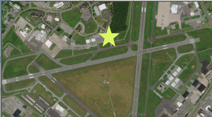
2000 Brett Road New Castle, DE 19720