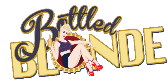
pizzeria + beer garden + nightlife

Bottled Blonde Pizzeria + Beer Garden, the high energy restaurant known as a destination for sports entertaiment is set to open it's 30,000-square-foot location on the Las Vegas strip.