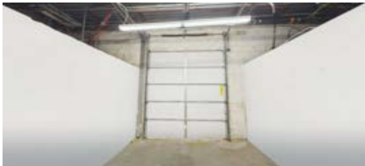
Warehouse Drive In Door