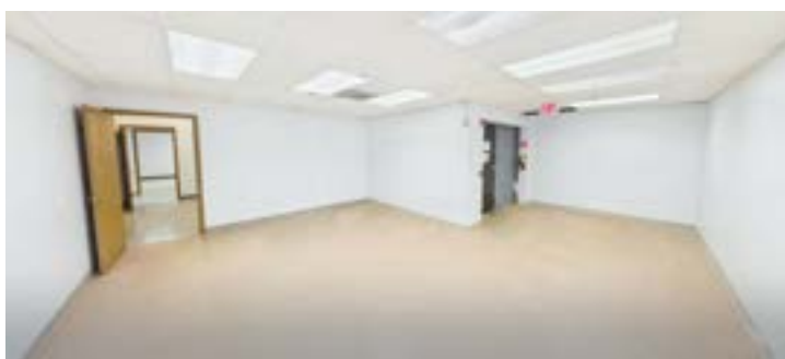
Work Area / Storage