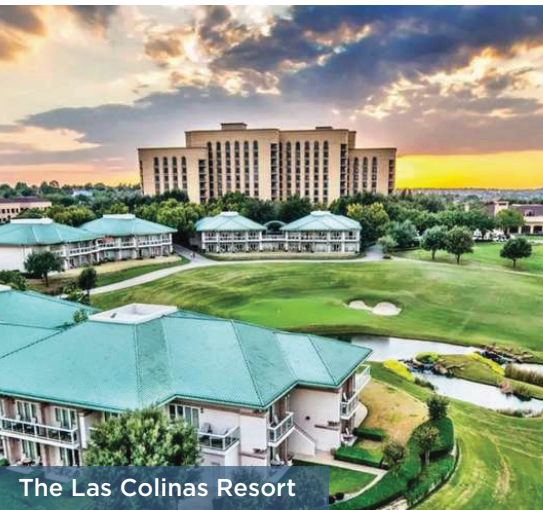
The Las Colinas Resort