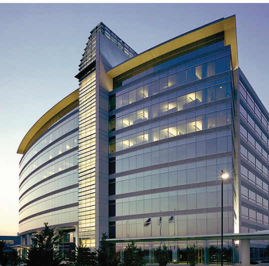
McKesson Corporation HQ

McKesson Corporation | Pioneer Natural Resources | Kimberly-Clark | NEC Corporation | Exxon Mobil | Nokia, Inc. | Microsoft | Verizon | CitiGroup | Fluor Corporation | Allstate Insurance | Caterpillar | Celanese