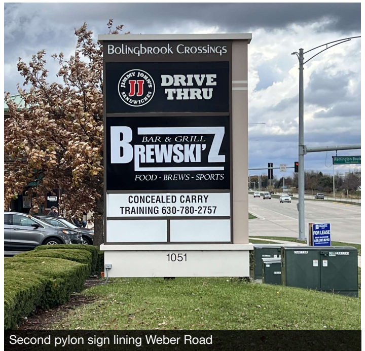
Second pylon sign lining Weber Road