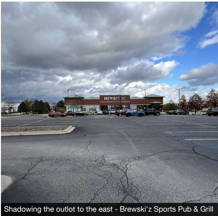
Shadowing the outlet to the east - Brewski'z Sports Pub & Grill