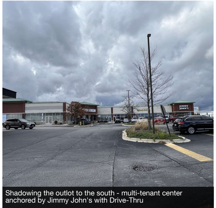
Shadowing the outlet to the south - multi-tenant center anchored by Jimmy John's with Drive-Thru