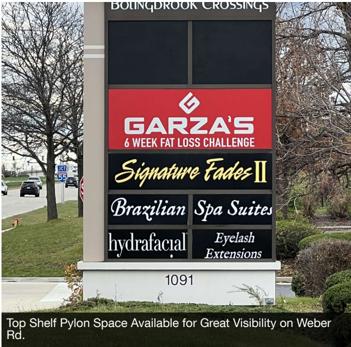
Top Shelf Pylon Space Available for Great Visibility on Weber Rd.

BOLINGBROOK CROSSINGS 1095 South Weber Road Bolingbrook, IL 60490