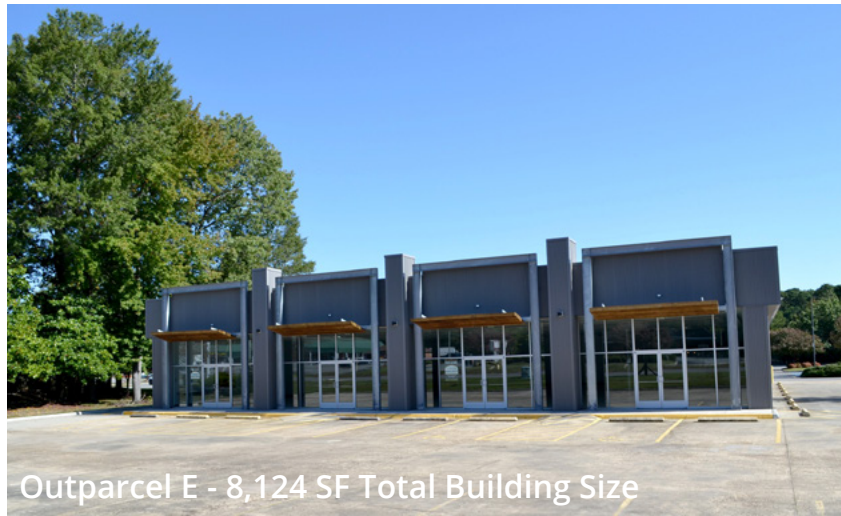
Outparcel E - 8,124 SF Total Building Size