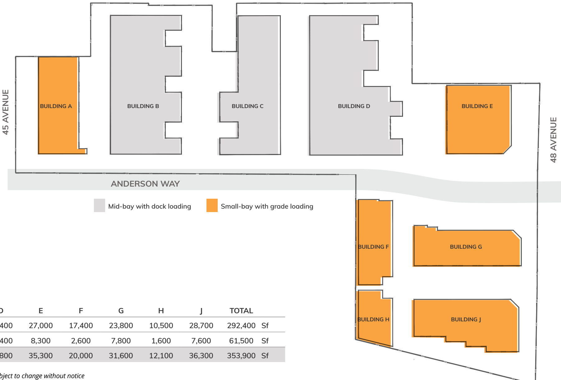
*These images are conceptual renderings and are proposed for illustrative purposes only; subject to change without notice