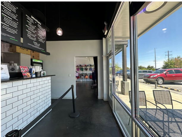
Suite 200 and 300 are connected as shown above