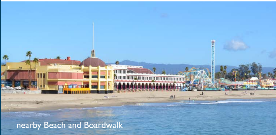
nearby Beach and Boardwalk