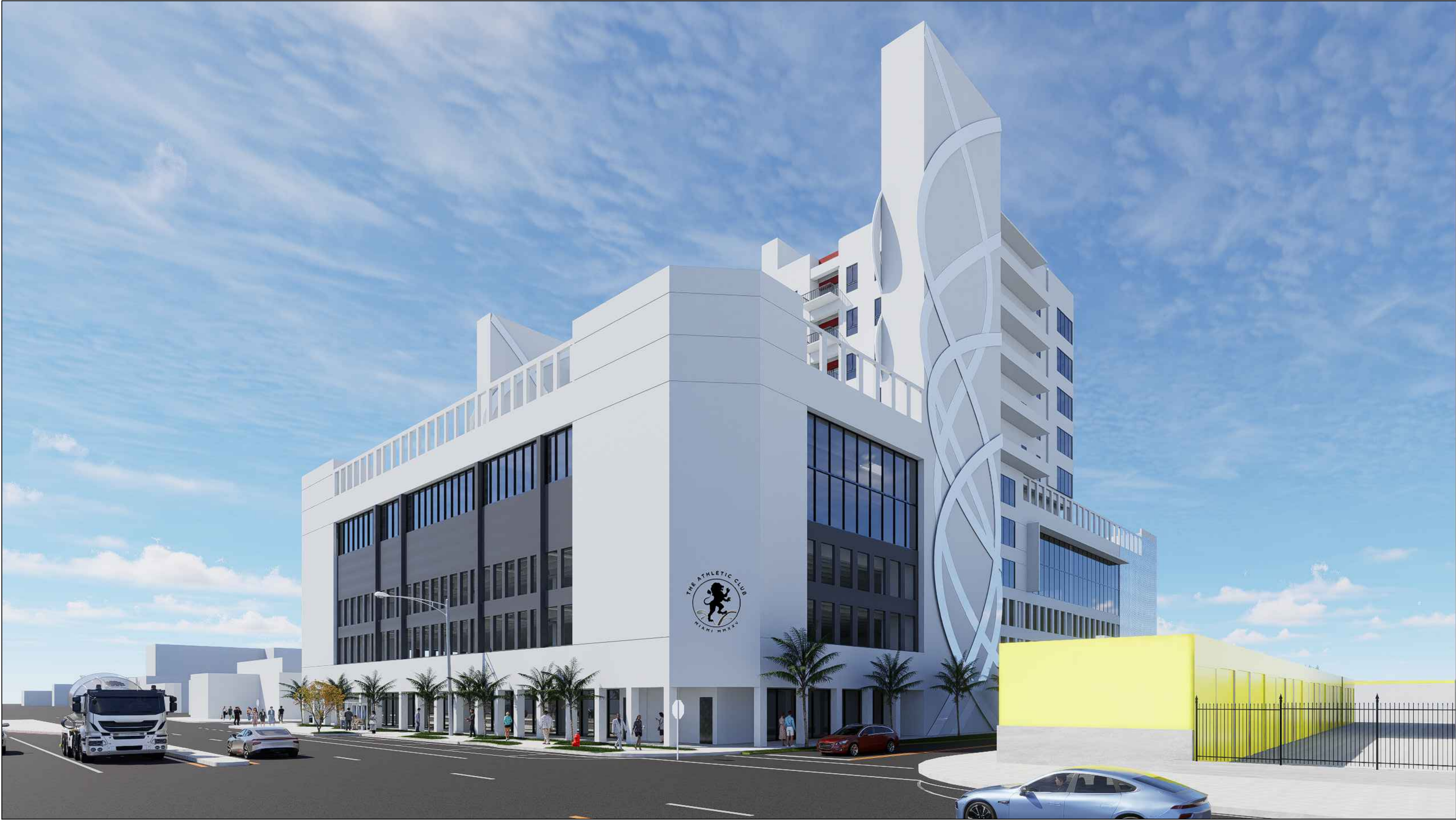
PERSPECTIVE FROM 7th AVE - (U.S. 441 NORTHBOUND) LOOKING NORTHEAST