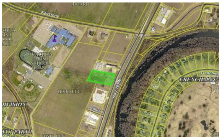
Tax Map Aerial