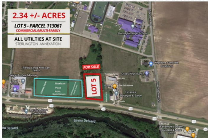
2.34 AC/Hwy 165