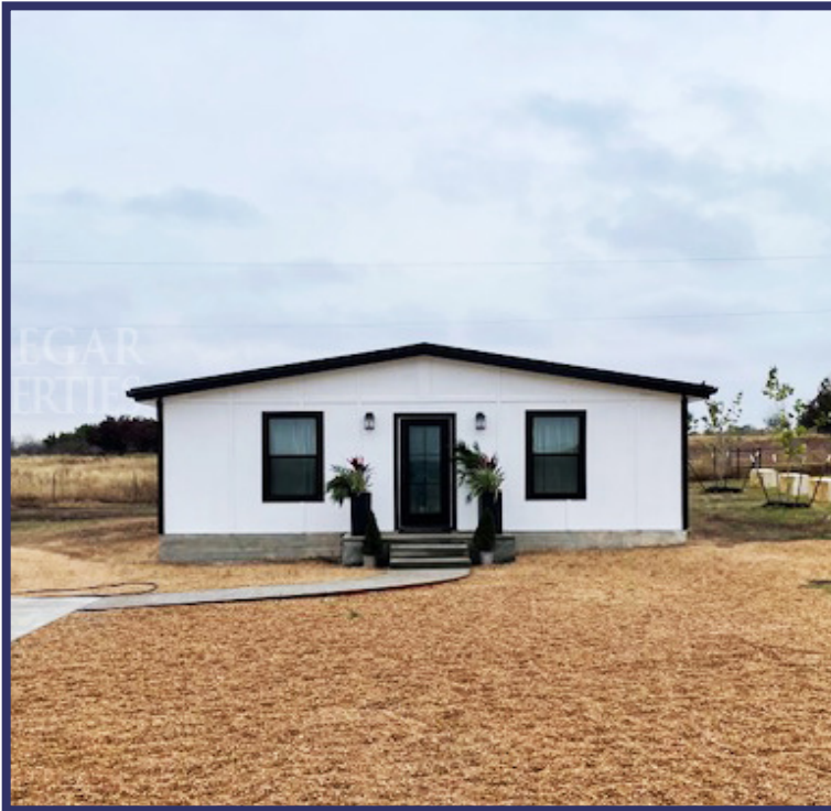
Private Dressing Suite