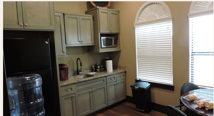
Kitchen complete with granite countertop.