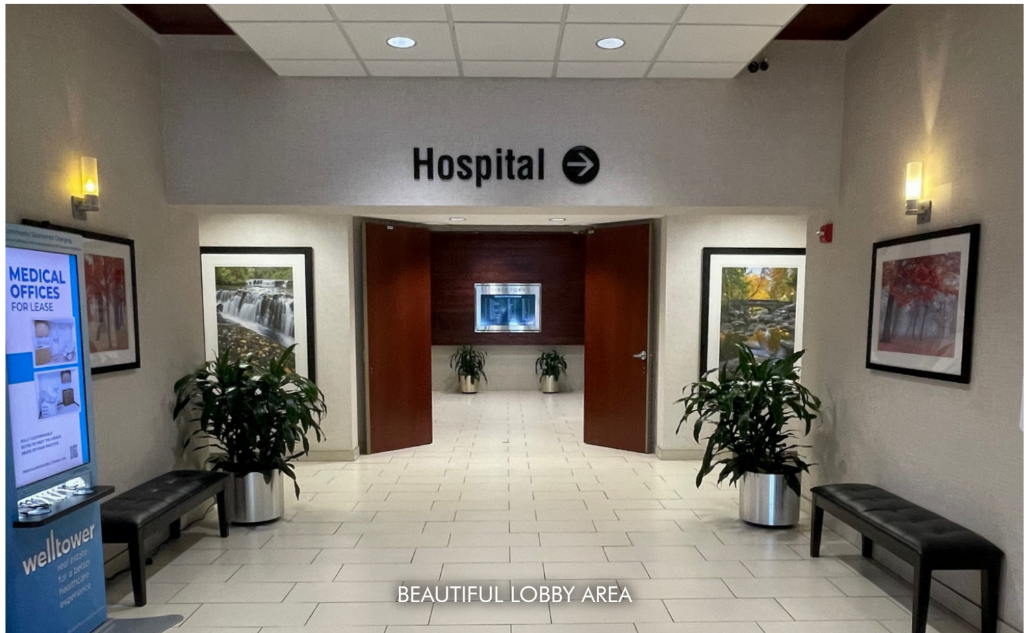
BEAUTIFUL LOBBY AREA