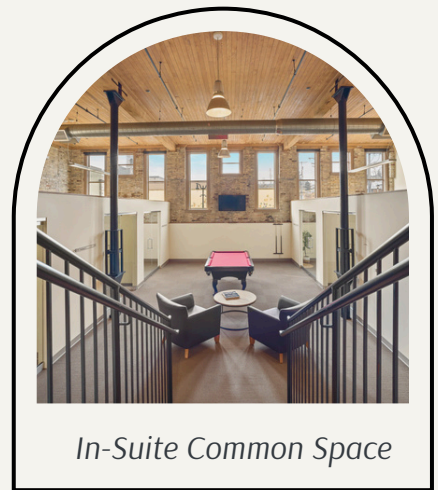
In-Suite Common Space

Bring your own lunch and coffee or enjoy all that downtown Port has to offer just steps from the front door