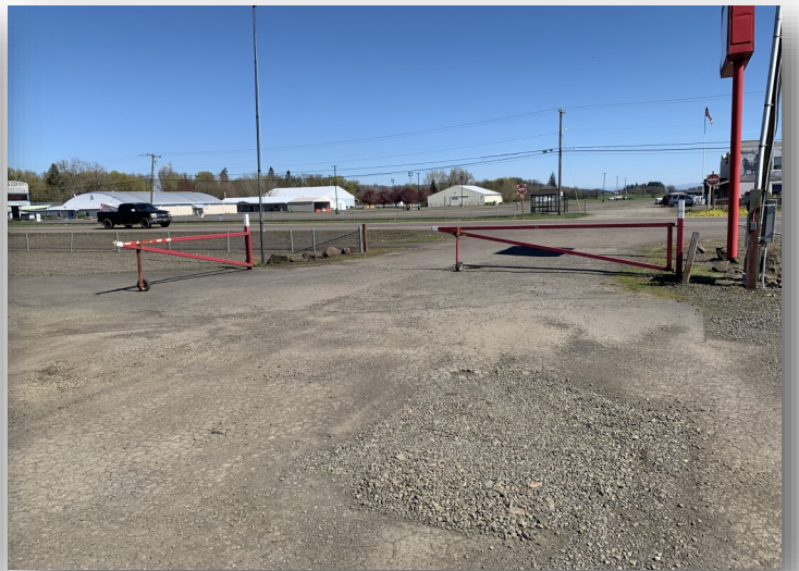
Visibility and Access From Highway 99W