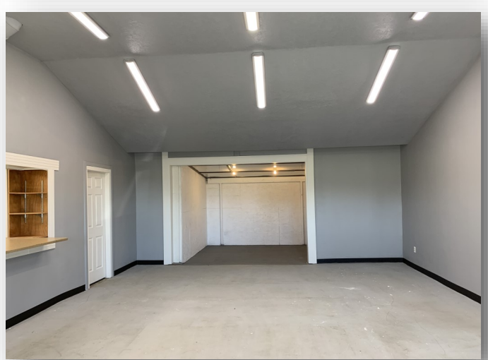
Showroom and Storage