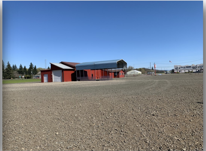
Yard and Building from the SW