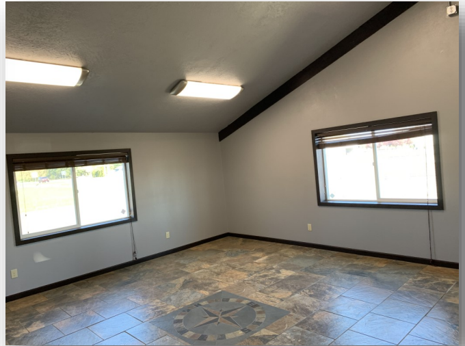
Front Office or Conference Room