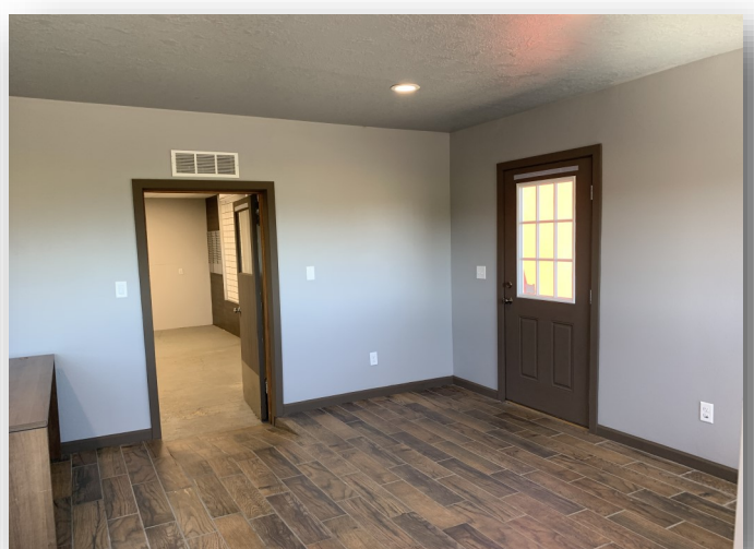
Interior & Exterior Private Office Access

This information has been secured from sources we believe to be reliable, but we make no representations or warranties, expressed or implied, as to the accuracy of the information. Reference to square footage or age are approximate.