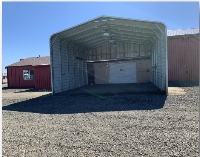
Covered Receiving Area for Office Door