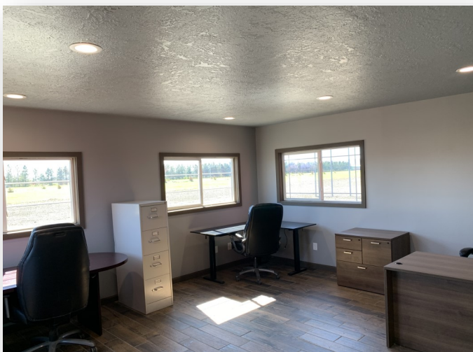
Rear Private Office