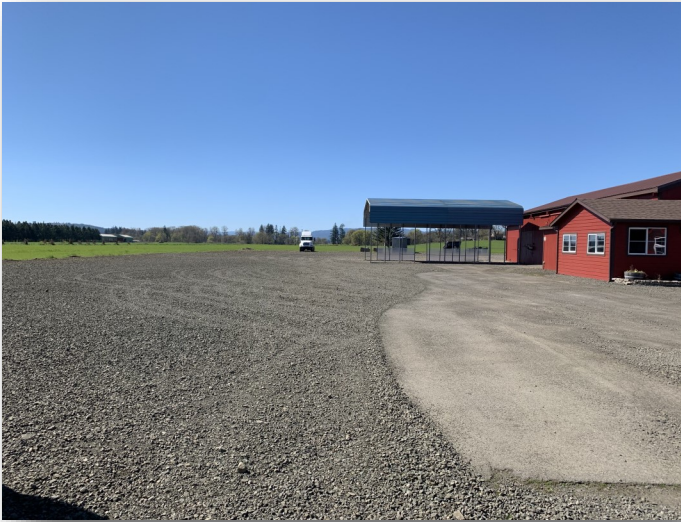
South Driveway, Yard and Metal Canopy