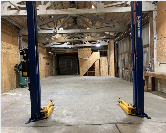
Lift and Warehouse to the West