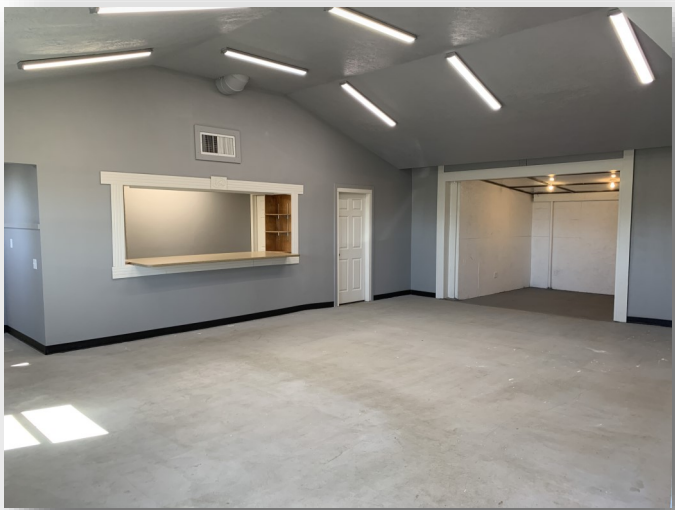
Showroom and Parts Counter