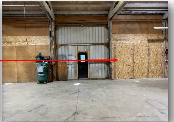
North and South Sliding Doors with Cross-Grade Ability