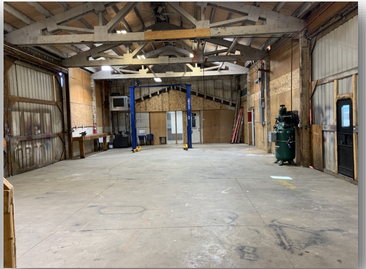
Warehouse to the East