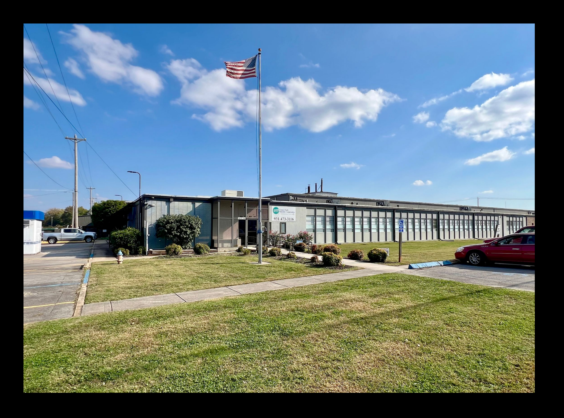
204 Red Rd, McMinnville, TN 37110