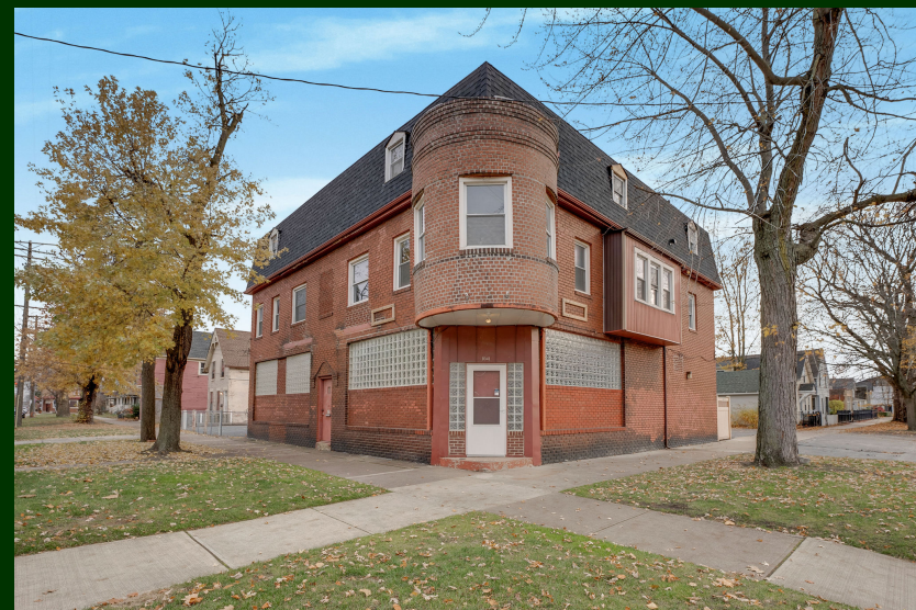
1041 Starkweather Ave, Cleveland, OH 44113