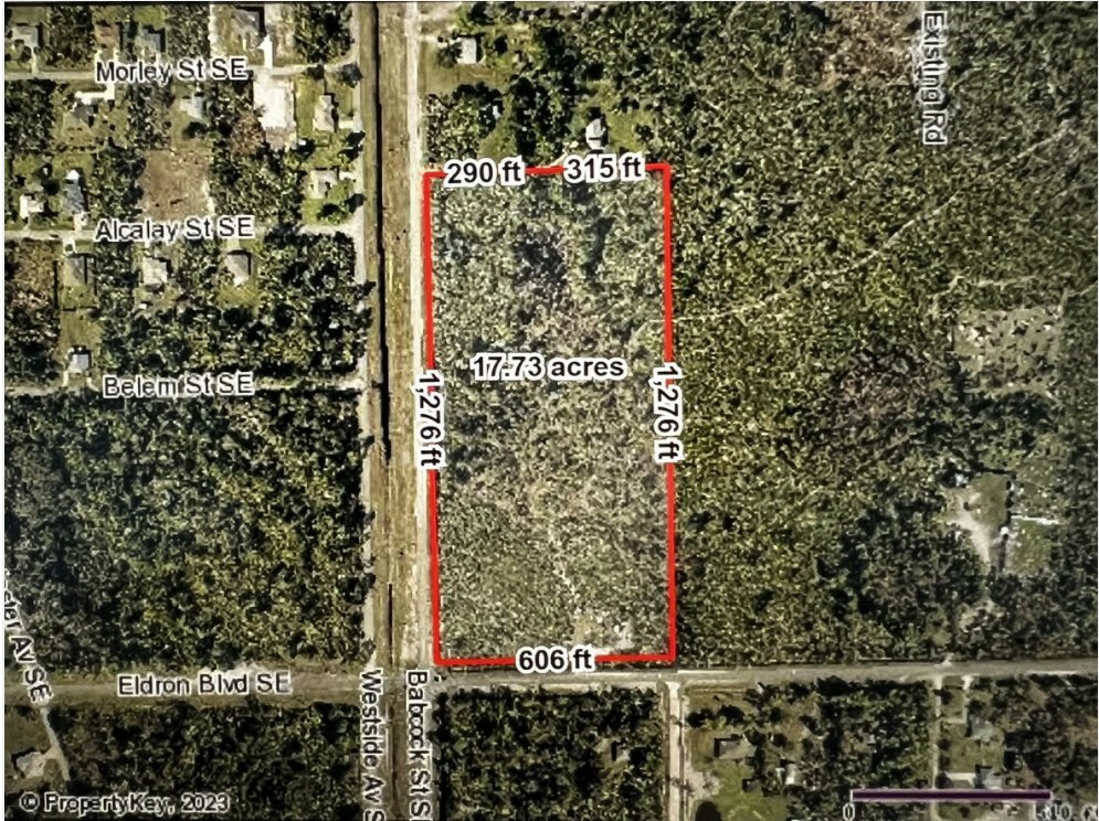
90 Grant Rd Palm Bay Land