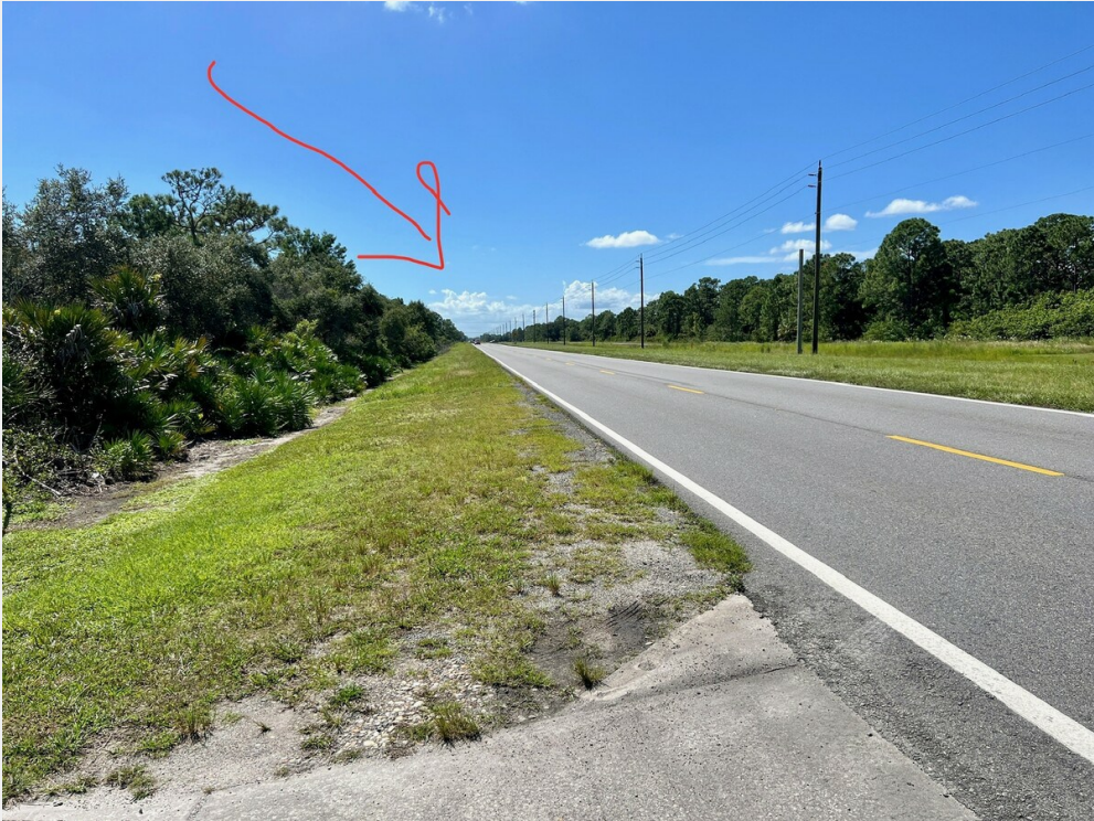
Babcock St SE