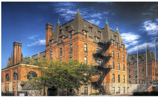
STADIUM HIGH SCHOOL