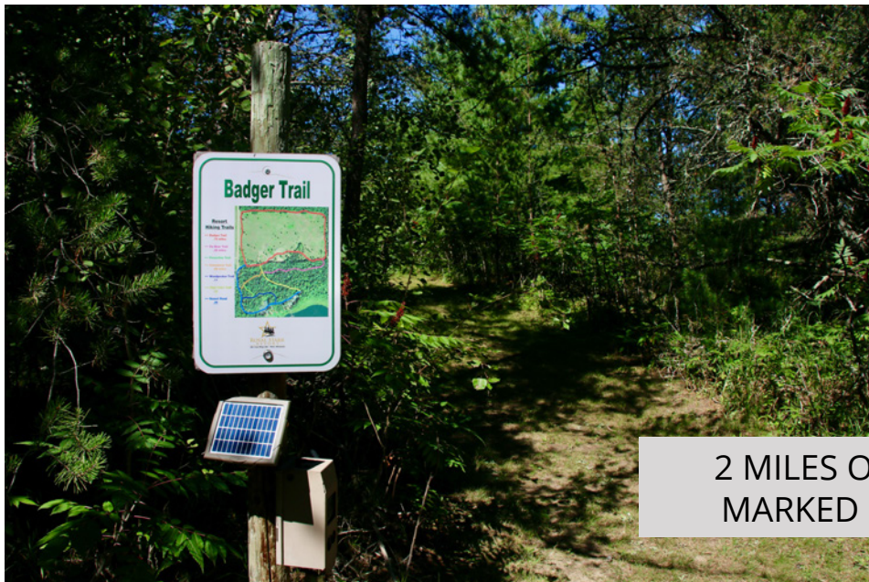
2 MILES OF GROOMED & MARKED HIKING TRAILS