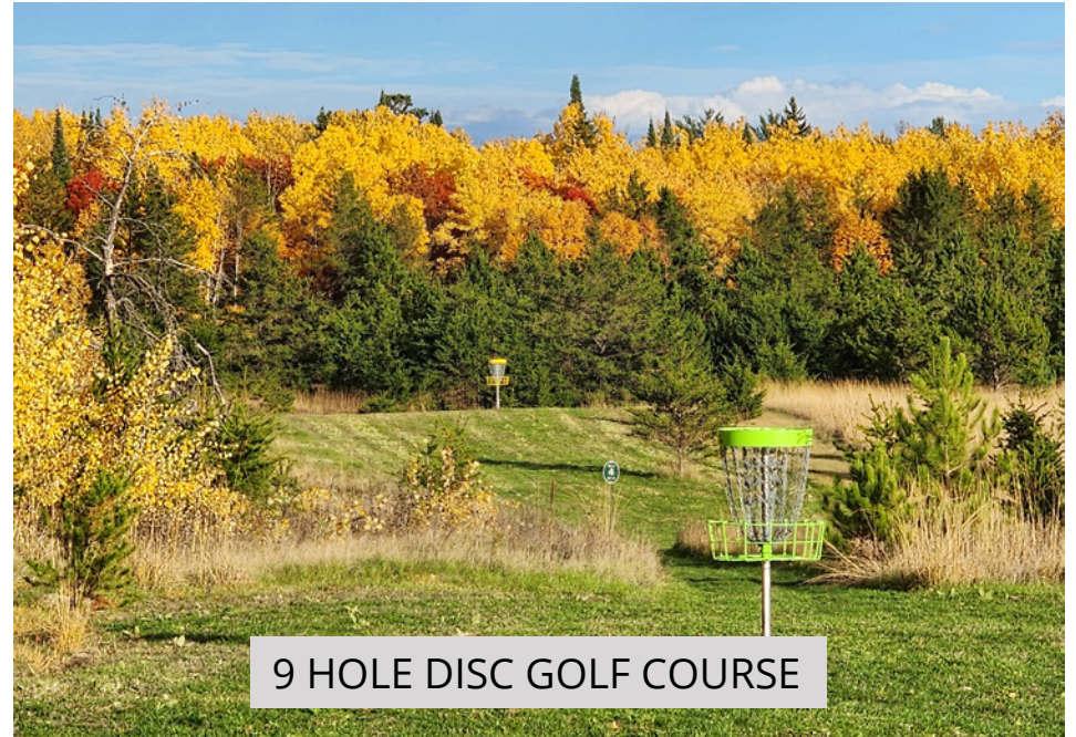
9 HOLE DISC GOLF COURSE