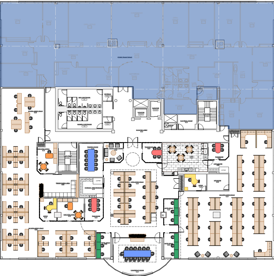
2ND FLOOR Divisible Suites 10,992 SF