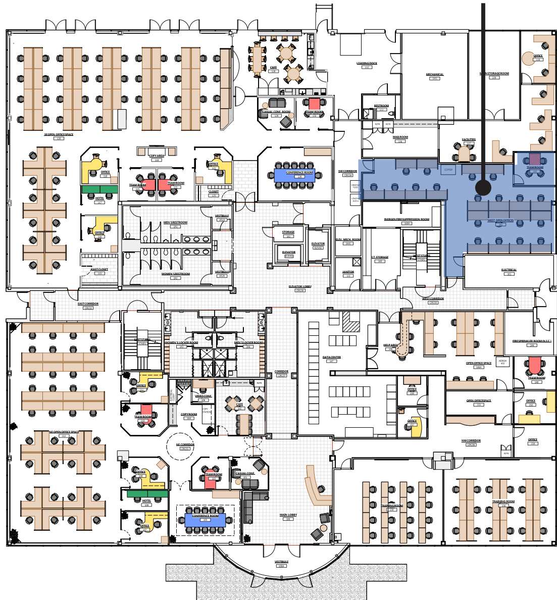
1ST FLOOR 1,456 SF