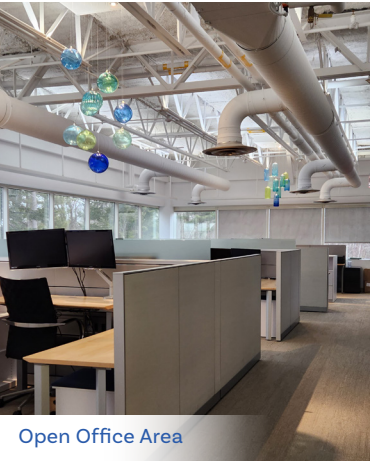
Open Office Area