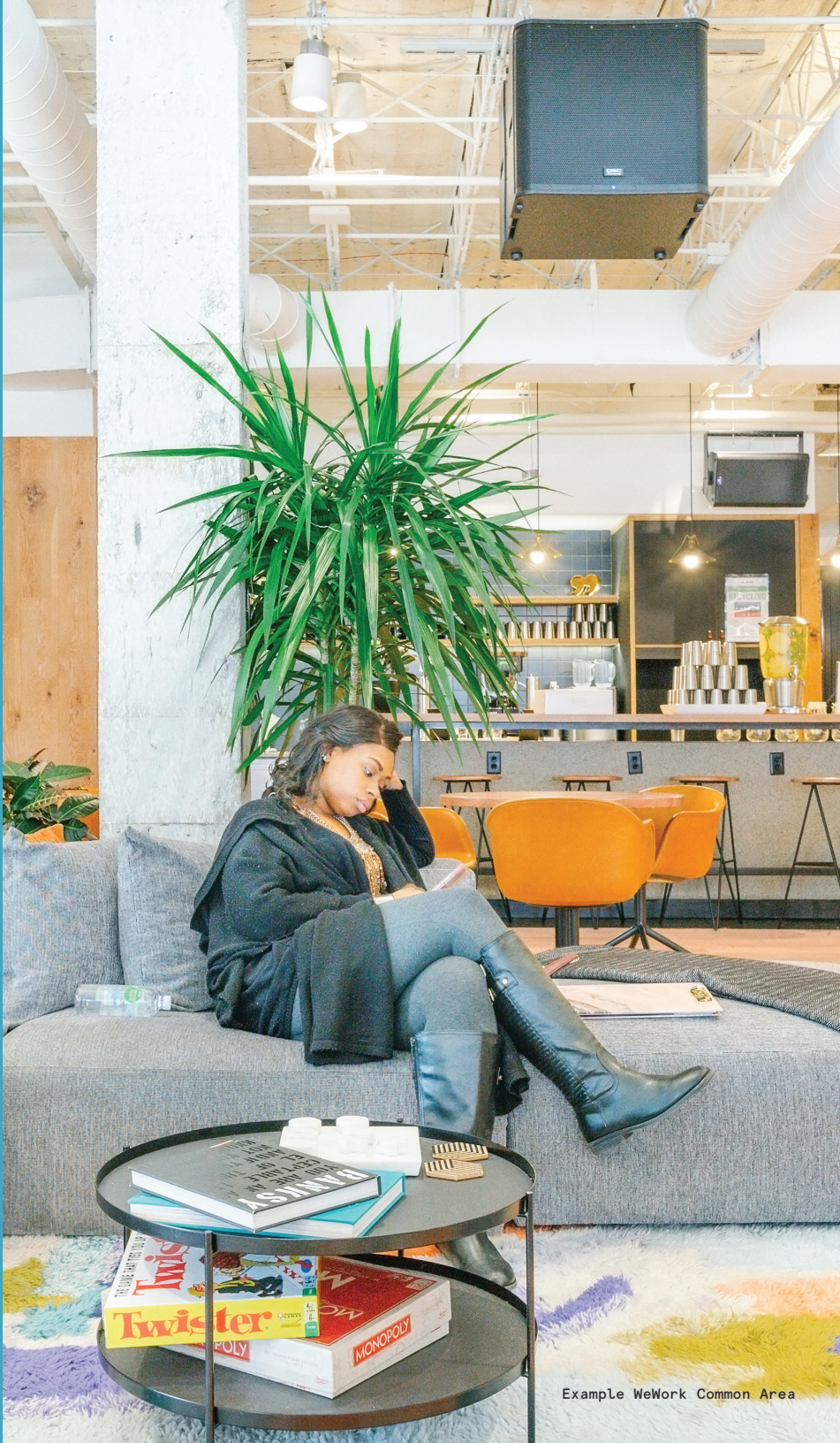
Example WeWork Common Area